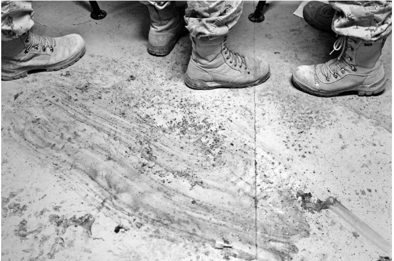
Figure 6. Louie Palu, Canadian medics at a Canadian Forward Operating Base are seen standing on a blood-stained floor while treating four Afghan civilians, one of whom later died from his wounds after they suffered injuries from an apparent improvised explosive device (IED) in Zhari District Afghanistan, 2007. Archival digital print (Photo: © Louie Palu).