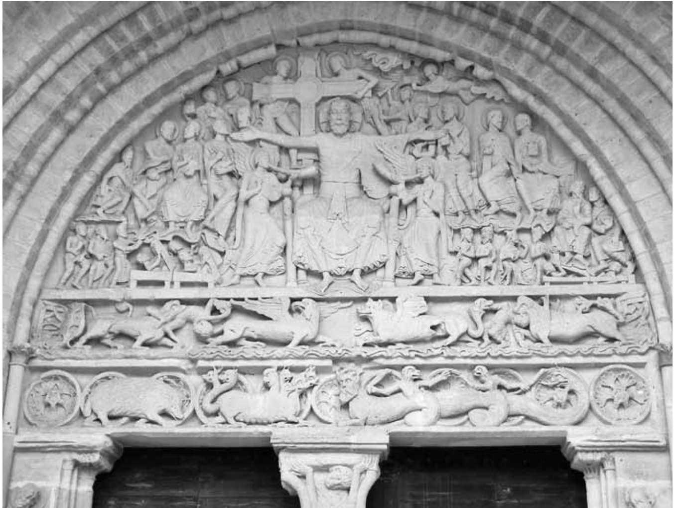
Figure 7. Tympanum, abbey church of Saint-Pierre at Beaulieu-sur-Dordogne.

over the twelve tribes of Israel. 56 The fully frontal presentation of the Souillac Peter is also highly irregular. The bare feet suggest that Peter is the apostle, but apostles are ordinarily presented in profile or semi-profile. 57 At Toulouse, Peter is presented in full frontality, but with his papal crown and shod feet, he is not depicted as an apostle. Marguerite Vidal has described the fully frontal saints at Souillac to be “seated in majesty.” 58 In the monumental art of the day, it was Christ alone who was thus seated, surrounded by his court, be it the court of apostles at Beaulieu or the court of kings at Moissac. The seating of a figure in majesty, with its implications for power, would ordinarily involve a visible throne. The chairs on which the saints at Souillac are seated are not readily visible, although the feet of both saints are flanked by small, somewhat recessed, clawlike feet, perhaps