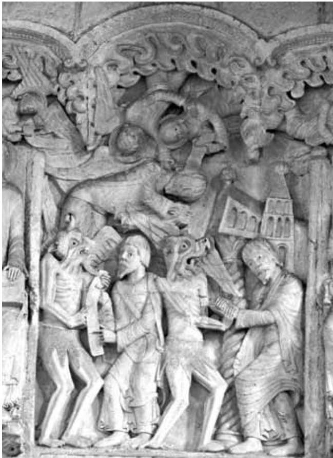
Figure 3. Central narrative component of the Theophilus relief, abbey church of Sainte-Marie at Souillac.

The iconography of the relief at Souillac can be considered against the textual traditions of the legend. The three superimposed elements on the left of the narrative field of the relief (fig. 3) represent the three major episodes of the legend—Theophilus’s fall, his penitence, and his pardon. 16 On the lowest level, Theophilus and the devil point to the agreement they have concluded. At the median level, Theophilus lies on his side before a church, his eyes closed. At the top, the Virgin and her accompanying angel return the recovered agreement to Theophilus. This ordering places the Virgin and angel in the spiritual realm, with the devil and errant human firmly at the base. At the centre, bridging the two realms in art as they did in the thought of the day, are penitence and the Church. Visually, however, we are not encouraged to read the relief hierarchically. Theophilus’s strong horizontal form acts as a barrier between the earthly and heavenly realms and turns the viewer’s attention toward that which transpires below. The relative scale of the three