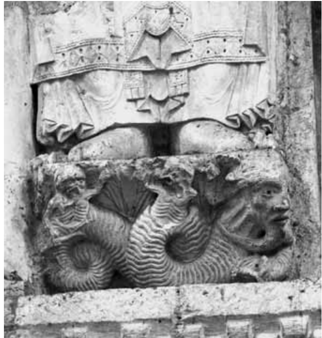
Figure 8. Serpent beneath monastic saint, Theophilus relief, abbey church of Sainte-Marie at Souillac.

To the angel who drops from the arch on the left, the monastic saint would appear to be reasonably centered and his occupation of the space defined by the arch would be modest. A different scene would reveal itself to the angel who crosses the arch on the right. Peter would appear to have moved to the extreme right of the space defined by the arch, the extent of his movement emphasized by the near-horizontal trajectory that the angel must take to reach him. Peter would have brought within his control, under his arch, the figure of his vassal, the metropolitan, and the cloistered church, the seat of the bishop. 65 As to the figure of the metropolitan, Blumenthal writes that "eventually, in the late eleventh century, the conferring of the pallium made the archbishop seem more like the pope's deputy with a delegated share in the universal primacy." 66 The cathedrals had been brought under the papal arch by the requirement that local bishops be subjected to the approval of the apostolic see or