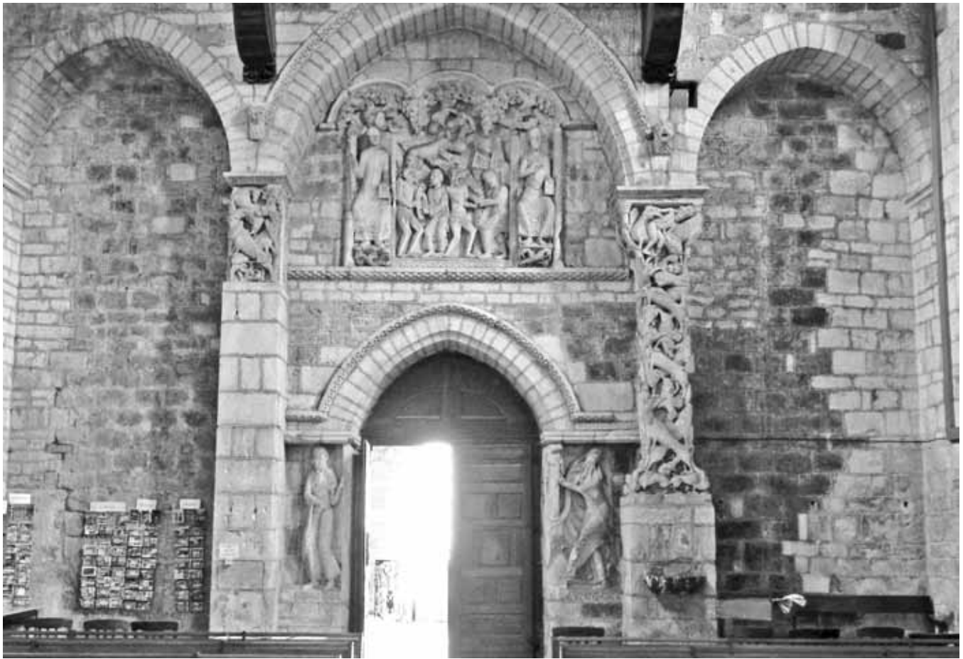
Figure 1. Inner-west wall of the nave of the abbey church of Sainte-Marie at Souillac.

it was most likely set originally within an old Carolingian tower porch over what was then the main entrance door to the nave. 10 The relief and the other sculptures now on the west wall of the nave are thought to have been moved into the nave in the course of seventeenth-century restorations to the west end of the church, during which the west wall of the nave is believed to have been constructed. Other than the fact that the relief was probably originally above eye-level, we cannot ascertain anything more definitive about the original setting of the relief that might assist in determining its meaning.