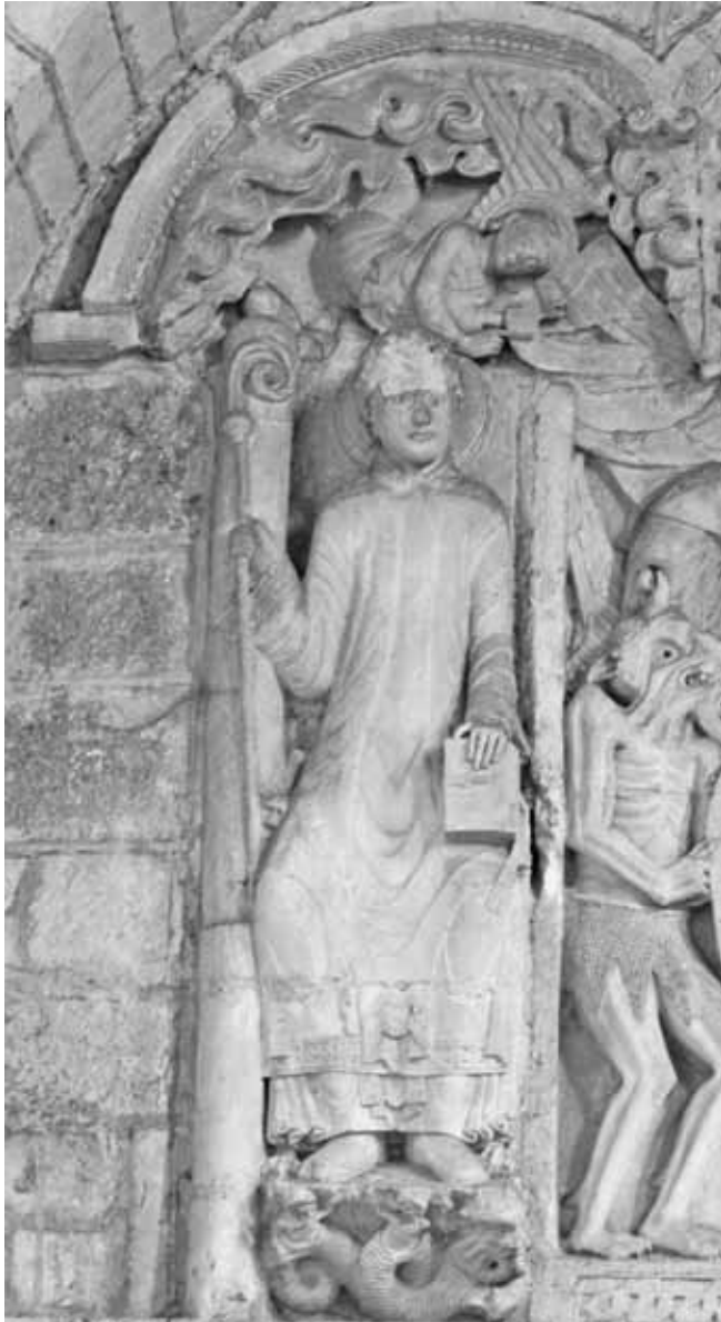
Figure 6. Scene under left arch, Theophilus relief, abbey church of Sainte-Marie at Souillac. Detail of fig. 2.

an irregular base. Thirion directed particular attention to the irregularities and anomalies in areas of the arch and base, but the framing elements have received little attention in the literature. A consideration of the framing elements and of the fact that the experience of the relief changes with the viewer's movement through space helps us gain a new perspective on the relief's narrative.