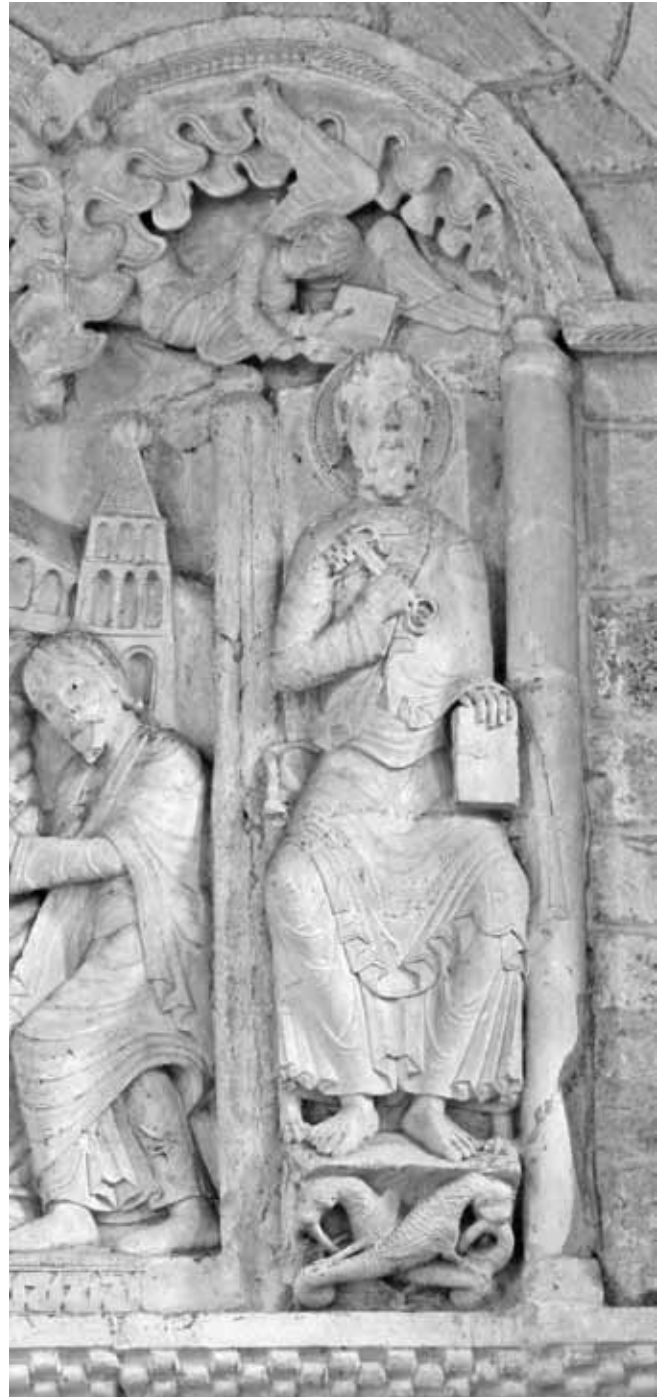
Figure 5. Scene under right arch, Theophilus relief, abbey church of Sainte-Marie at Souillac. Detail of fig. 2.

My analysis so far has focused solely on the meaning of the relief’s narrative. It is important also to attend to the flanking seated saints and to the setting beneath an irregular arch upon