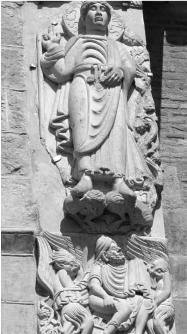
Figure 4. St. Peter containing Simon Magus, Porte Miègeville, Basilica of Saint-Sernin at Toulouse.

the devil echoes the placement of the agreement between the two in the first scene. It breaks the flow from left to right and separates Theophilus in vassalage from the three standing figures to the left. The column is too significant in scale, location, and form to be merely a decorative backdrop for the ritual hand-clasp. The most obvious association for such a column would have been with the Shrine of the Apostle at Old St. Peter's in Rome 34 even though homage to and investiture by secular authority certainly did not take place there.