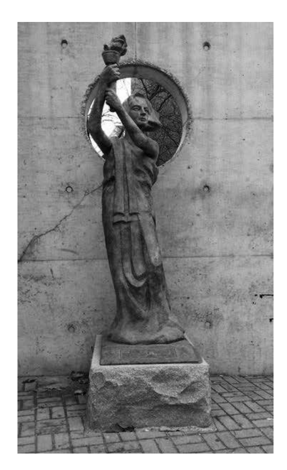
Figure 4. Ruth Abernethy. Goddess of Democracy. York University Student Centre, Toronto. 2012. Bronze.