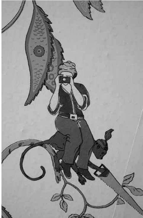
Figure 6 (below). Millie Chen, wallpaper (detail), 2007. Found wallpaper (Cathay Pastoral Vine, Stroheim & Romann Inc.), acrylic paint and ink. Canadian Cultural Centre, Paris, France. Collection of the artist, Rideway, Ontario, Canada.

of perceptual and perspectival displacements. Reimagining modes of visualization perpetuated through exoticized craft display in colonialist interiors, Chen depicts a woman who looks through her camera out into the gallery space, hence mirroring the patrons who view the wallpaper installation. 46 | fig. 6 | Discussing the audiences of her exhibition, she suggests that she was interested in practices of cultural embodiment that encompass “... day to day body language ... how we dress the body up ... the public face of the body, the public inscription, private rituals ... [W]e [are] conditioned to move through identity ... and to handle our body in a certain way and that is very culturally based.” 47 Blurring the boundaries between the seeing subject and the viewed other in gallery exhibitions and cultural collective settings, Chen