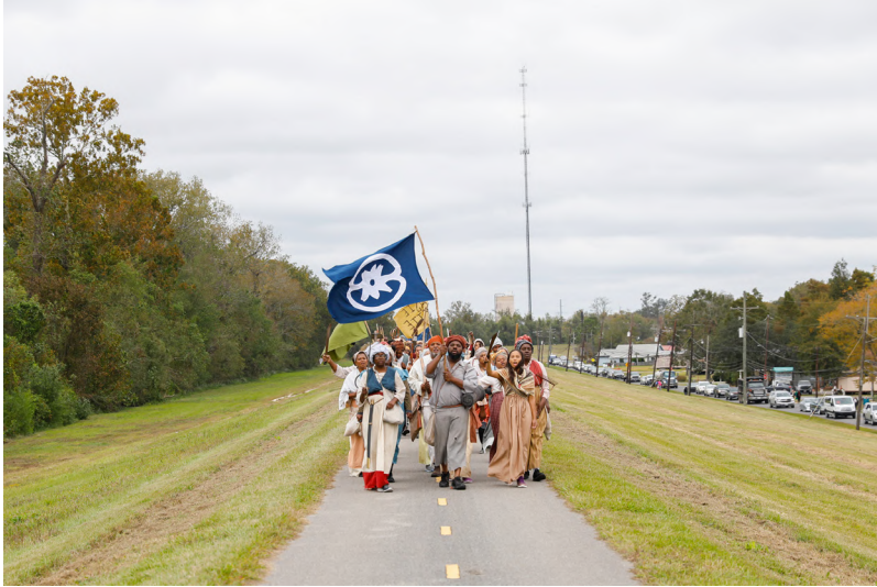
Figure 5. Documentation of Slave Rebellion Reenactment , a community performance initiated by Dread Scott outside New Orleans, November 8, 2019.