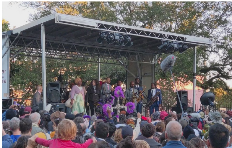
Figure 7. Slave Rebellion Reenactment, Congo Square, New Orleans, November 9, 2019.

magazine/letter-from-new-orleans-down-river-road/.