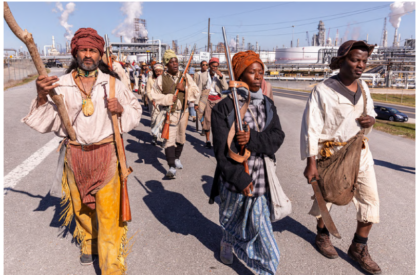
Figure 2 (opposite). Instagram images of Slave Rebellion Reenactment , November 8–9, 2019.