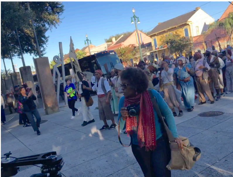
Figure 4. Dread Scott, Slave Rebellion Reenactment , arrival at Congo Square, New Orleans, November 9, 2019. Performance.

By arriving at a triumphant conclusion, Slave Rebellion Reenactment reframed the layered history of Tremé/Congo Square/Louis Armstrong Park: a site of Black conviviality even in the midst of slavery, an eighteenth-century plantation, a free community of colour, a vibrant Black commercial area, a neighbourhood half-blighted by urban development, then officially dedicated to Black history, a site of gathering in times of crisis and celebration. As the “rebels” moved from the German Coast to Congo Square they moved from performing history to performing collectivity as a mode of imagining future social orders.