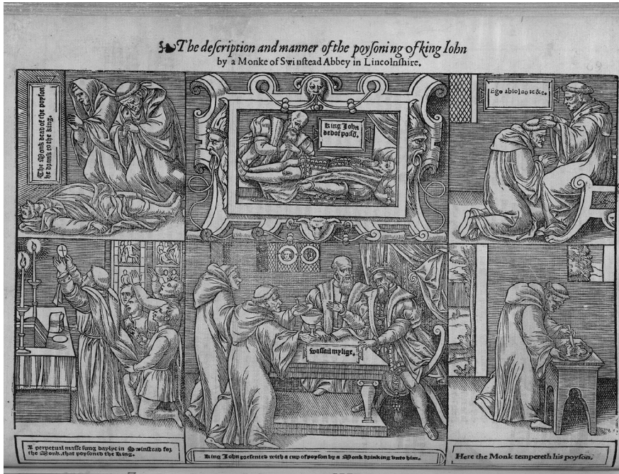
Fig. 2. John Foxe (1516–87). Actes and monuments (London: [Iohn Day], 1563, facing leaf I5 recto: The ... poisoning of king Iohn. Call #: STC 11222.

Protestant dramatists literally and dramatically demonized Catholic clergy and banished angels from their stages. 49 The plays composed by Reformers in the mid-sixteenth century used the medium of theatrical performance to address issues of doctrine, advocate for Protestant reforms, and attack the Roman Catholic Church and certain traditional practices associated with it. Stage devils continued to appear in Reformation theatre in order to “enact whatever opposed individual well-being and the sacramental community,” as John Cox