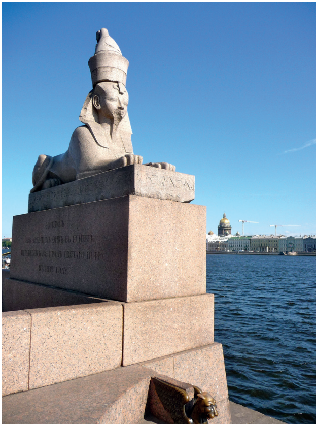
Figure 4: Egyptian Sphinx in front of the Academy of Arts in Saint Petersburg, 2012.

the Fontanka, and Quay with sphinxes at the Universitetskaya Embankment in Saint Petersburg (see Figure 4). The Sphinxes from the time of Pharaoh Amenhotep III (1390-1352 BC) were purchased and brought from Alexandria in 1832 by the Russian officer and diplomat Andrei Murav'ev. Initially the ancient monuments were located in the courtyard of the Russian Academy of Arts in Saint Petersburg, but in 1834 they were moved to the waterfront of the Neva River in front of the Imperial Academy of Arts (Struve 1912). To complement the architectonics, the Russian architect Konstantin Thon designed the pedestals for the Sphinxes and added columns and griffins to the site.