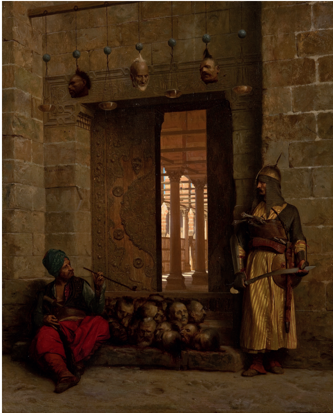
Figure 1: Jean-Léon Gérôme, The Doorway to the Mosque El Assaneyn in Cairo where the Heads of the Rebel Beys Were Exposed by Salek-Kachef, 1866. Oil on panel, 54 x 43,8 cm. © Orientalist Museum, Doha. OM. 184.