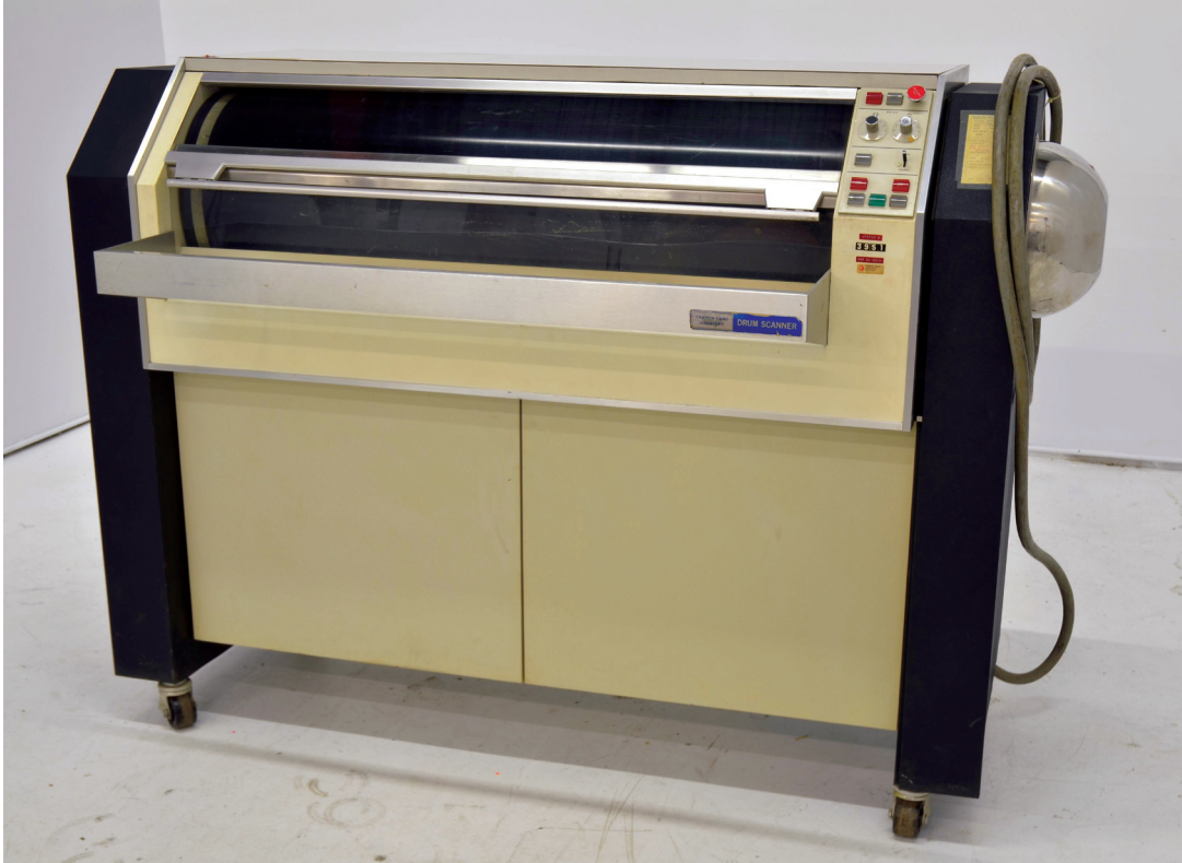
Figure 2: This scanner was developed by International Business Machines (IBM) for the Canada Land Inventory. It converted graphic information to digital format, an essential step in relation to the Canada Geographic Information System. The scanner is now part of the Ingenium (Canada's Museums of Science and Innovation) collection. IBM Scanner, 1963, Artifact No. 1986.0821

was also evident in relation to the CGIS project. An early assessment of the technological feasibility of CGIS warned there was not “any existing instrument suitable for directly reading map data into computer storage.” 88 In the mid-1960s, IBM designed a digital map scanner for the CGIS project, based in part on work they had already been doing on similar issues. 89 The scanner, the first ever to be made and used, was operational from 1967 to the early 1980s, and is now preserved in the Canada Science and Technology Museum’s computing collection (Figure 2). 90