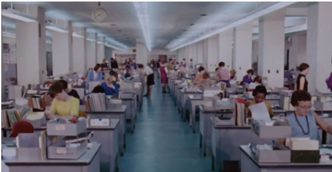
Figure 3: These images are stills from the 1968 film about the Canada Geographic Information System [CGIS] titled “Data for Decision.” The top and bottom images illustrate the challenges with storing and analyzing available data pertaining to natural and human resources. The middle image on the left shows a stylized human eye at the top and a series of transparent maps below, dramatizes the layering function of CGIS. The middle image on the right shows a manager consulting CGIS-generated data in developing an innovative solution to a resource-management problem. The film can be viewed online via the National Film Board website: https://www.nfb.ca/film/data_for_decision/