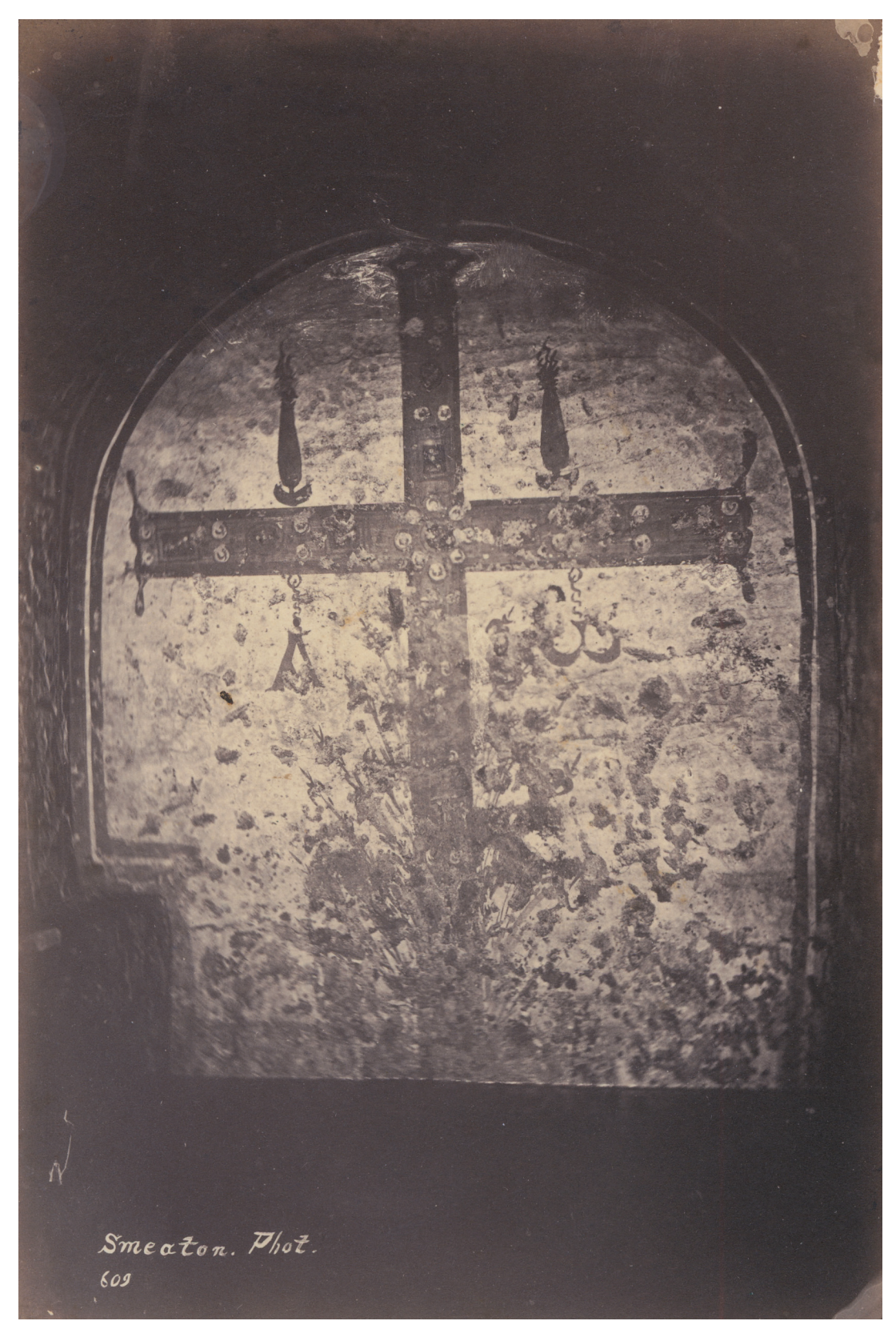
\label{eq:Figure 6.} \textbf{Elaction}, \textbf{Mural depicting a jewelled cross}, \textbf{Catacomb of Pontianus}, \textbf{Rome} \ (1867). \ \textbf{BSR Photographic Archive}, \textbf{John Henry Parker collection}, \textbf{JHP-0609}.