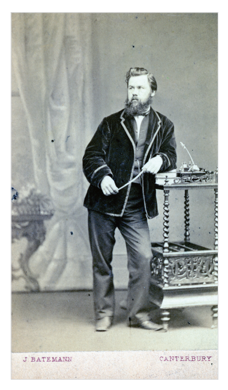
Figure 1. John Batemann (Canterbury, UK), Photographic portrait of Charles Smeaton, 1866. Smeaton family archive, Toronto.

battle against the enemy of inadequate light. Low light levels, slow emulsions, and lengthy exposure times created a dependence on the vagaries of weather, with the result that photographic studios were frequently located on an upper floor, in spaces provided with large windows and skylights, in order to take the maximum advantage of natural sunlight. When the itinerant American duo G.W. Halsey and Henry Sadd opened the first daguerreotype studio in Quebec City in October 1840, above John Grace's confectionary store on Rue Saint-Joseph, they invited interested readers of The Quebec Mercury to visit and inspect their equipment, but they noted that this could happen "on sunshine days only," advising that the production of images required exposures of up to four minutes.<sup>2</sup> Their enterprise was short-lived, and when they returned to New York the following month the same newspaper reported that: "Tired of waiting for sunny days, the proprietors of the Daguerreotype have left this city for 'warmer regions and a clearer sky.' The last week has been particularly unfavourable to the operation of their apparatus." Despite the use of head and neck braces, those posing for