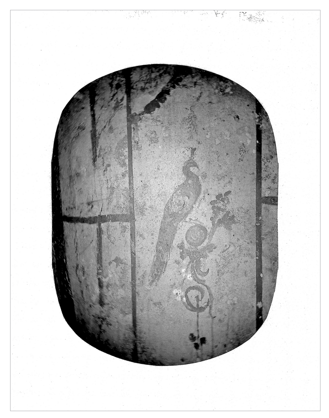
Figure 2. Charles Smeaton, Peacock, Catacomb of the Vigna Randanini, Rome (1866/7. JHP-0561.

(Fig. 3) or simply "Smeaton" (629). These notations would have been produced by painting a signature on the original glass plate. A subsequent version of Parker's catalogue added a note regarding the new technique: "The Fresco Paintings in the Catacombs are taken with the magnesian light, which has an appearance similar to moonlight."<sup>20</sup>