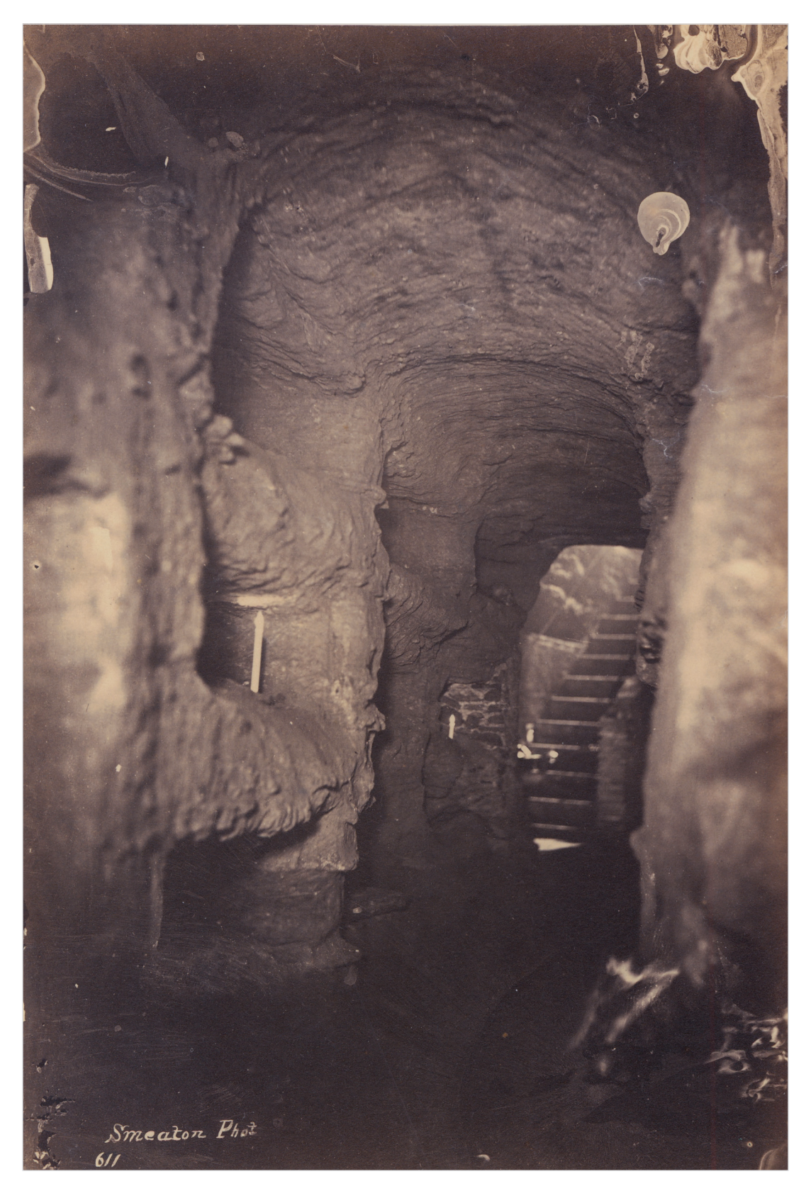
Figure 3. Charles Smeaton, Entrance to the Catacomb of Pontianus, Rome (1867).