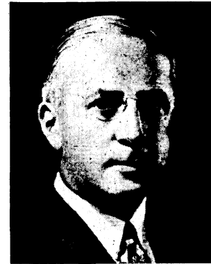
The Honourable J. L. Ilsley, Minister of Finance (Canadian Business, 1944)