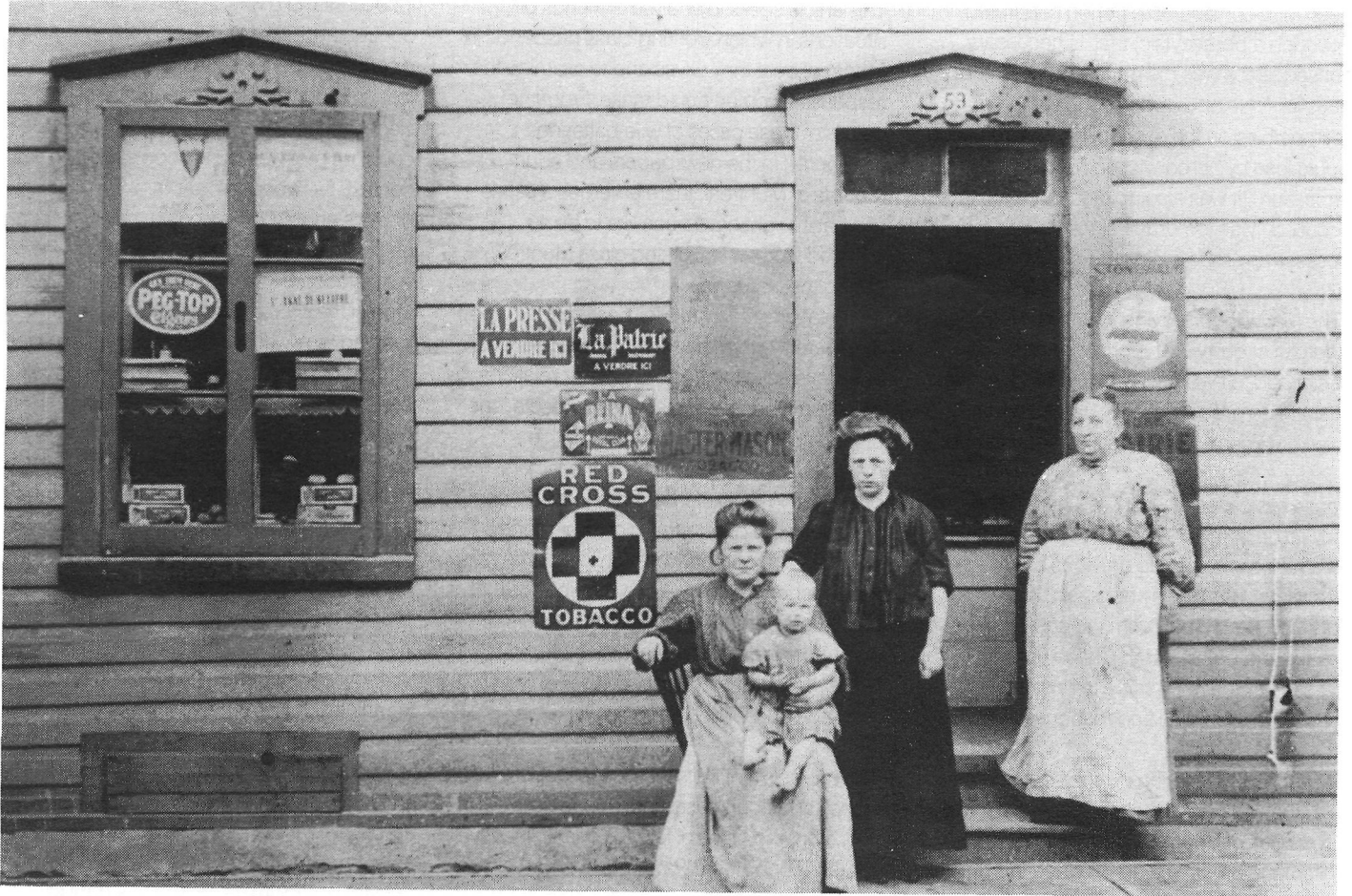
Date unknown. A grocery store in St. Henri during the later half of the 19th century.