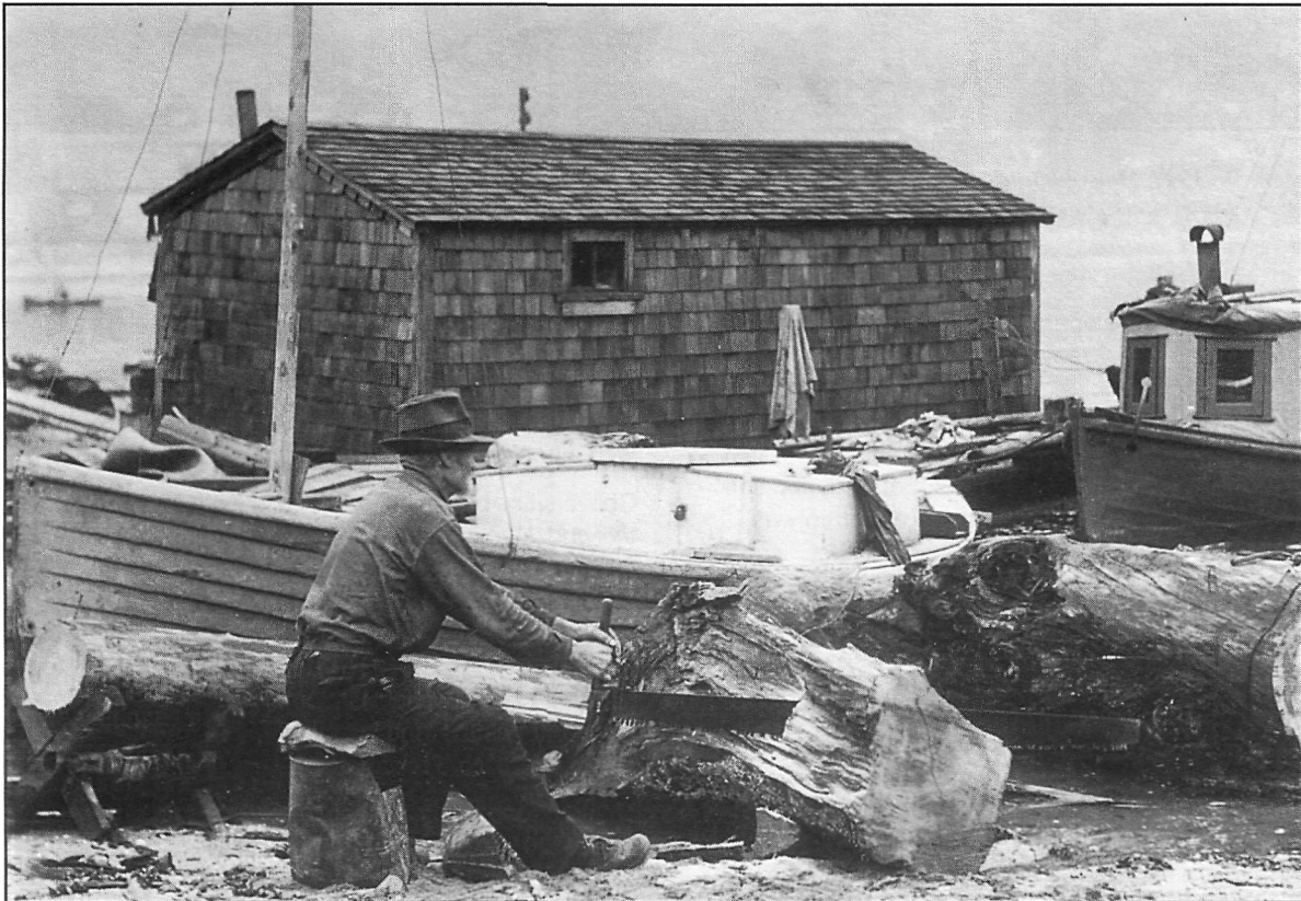
Figure 2: Floathouses and boats such as these, photographed in 1934, may have adjoined the False Creek shacker's house boat.

Sewage disposal and fire hazards were major problems for all foreshore dwellers. Toilets placed over tidal flats and sewer out-