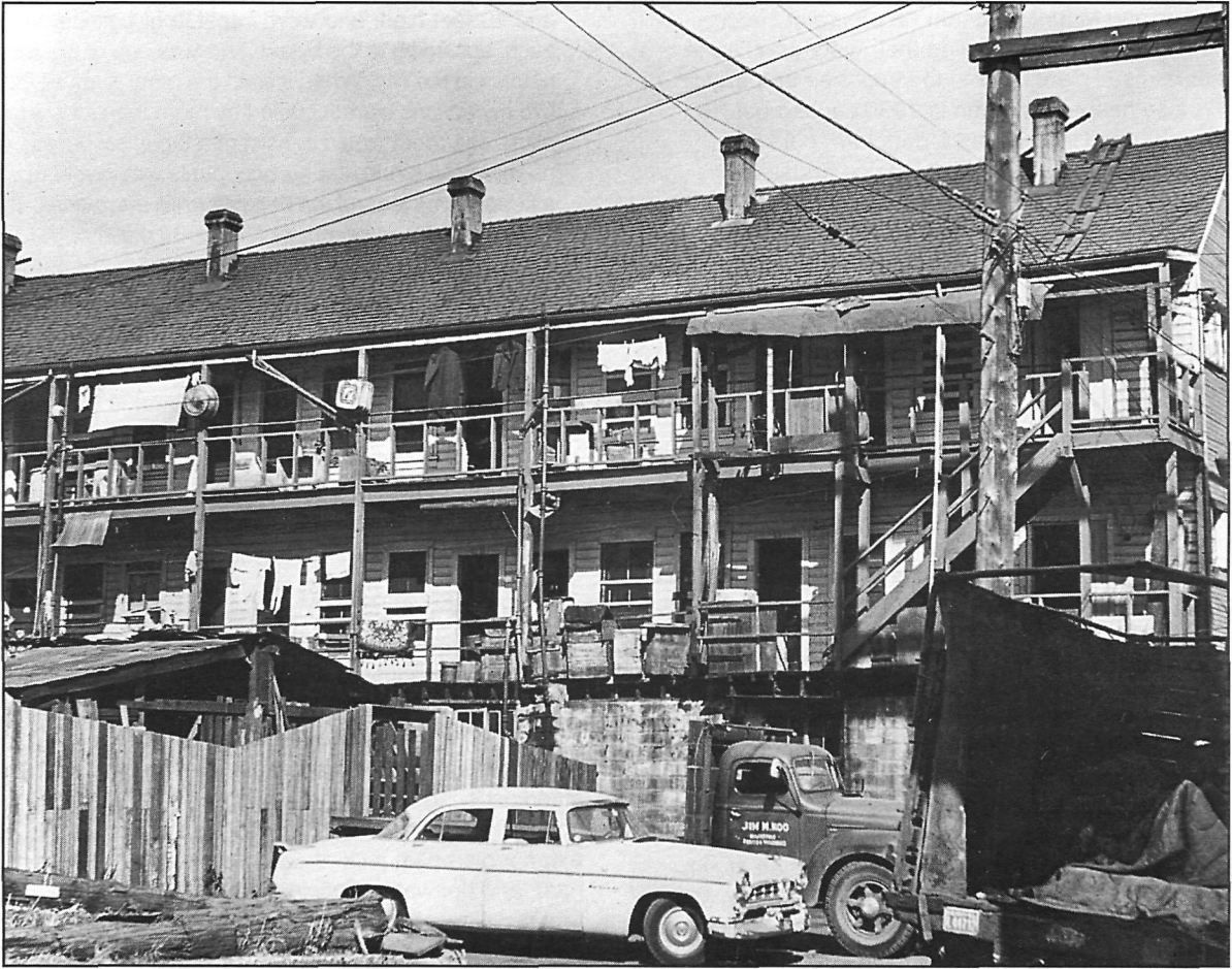
Figure 4: These East End cabins, photographed in about 1960, are examples of the dreary alternative lodgings available to the False Creek shacker.

pension, lived in a comfortable, “roomy enough” cabin partitioned off into bedroom, kitchen, and living room areas. Thus, depending on congestion, cost, location, management, and maintenance, surroundings in individual lodgings varied from miserable to cheerful.