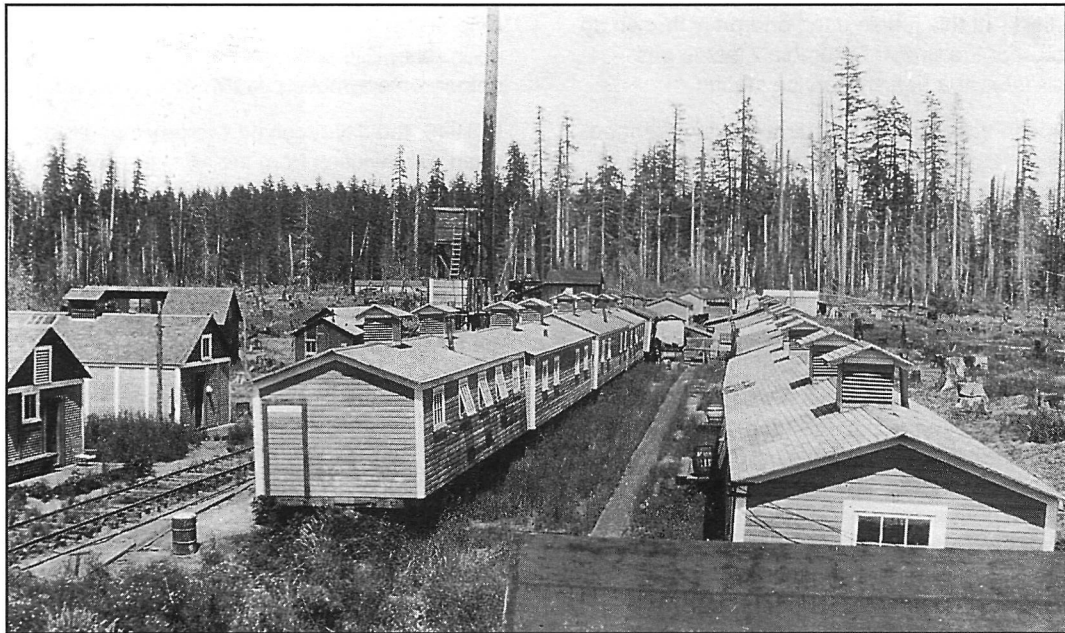
Figure 5: Many residents of lodging houses in downtown Vancouver had lived in bunkhouses such as these photographed in 1922 at the International Timber Company's Camp 4 on northern Vancouver Island.