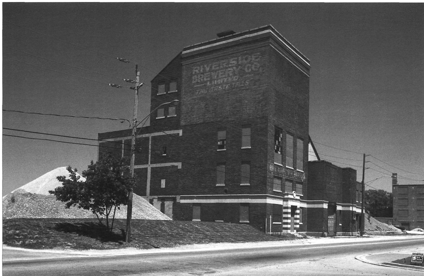
Riverside Brewery, Windsor, ON

(Silo #5) has generated a great deal of heated debate. 39 The conversion of many of the old industrial buildings along the Lachine Canal into condominiums has likewise proved to be controversial. David Fennario's 2005 play Condoville , a sequel to his iconic 1979 play Balconville , explores some of the tensions surrounding these issues in Pointe Ste-Charles. While there has been some interesting research on gentrification in inner city areas, much more work needs to be done. 40 The incorporation of the aesthetic of industry into landscapes of consumption in Winnipeg (The Forks), Toronto (The Distillery District), Montreal (Cité Multimédia) and elsewhere needs to be critically examined vis-à-vis deindustrialization. In what ways are changes to the urban landscape viewed and contested? How do they alter memory and attachment to place? Waterfront areas of major cities are particularly interesting in this regard. There is also the matter of the emerging aesthetics of deindustrialization. There are hundreds of websites dedicated to industrial ruins of every shape and size and any number of travel guides to the ghost town nearest you. Walk into any tourist shop on Water Street in St. John's and you can buy a photographic image or painting (usually of a house being moved) representing resettlement in the 1960s. How do we explain the appeal and commodification