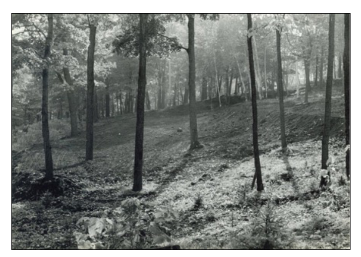
Figure 5. Ground view of Mount Royal after the Morality Cuts in autumn 1960; notice the sparse trees and nearly non-existent underbrush.

down a birch if its space would mean that an oak could breathe and survive. Lacking vegetation, most importantly trees and undergrowth, erosion worsened the condition of the Mountain, creating a vicious cycle of soil erosion and windthrow-less vegetation meant more soil erosion and therefore weaker plants (figure 6). The systematic elimination of the underbrush accentuated these issues and effectively fashioned Mount Royal Park's "bald" image. As one opinion piece pointed out in 1959, "Moussorgski n'aurait jamais imaginé que sa musique prendrait une telle actualité à des milliers de milles de l'Oural!"78 According to the author, Night on Bald Mountain by Russian composer Modest Moussorgsky reflected the ecological and metaphysical state of Mount Royal Park at that time. The unintended result revealed the intricate relationship between modernist ideals and the natural environment; "the administrators' forest" increasingly made the park an artificial construction and demonstrated the irony of human intervention in the park.<sup>79</sup>