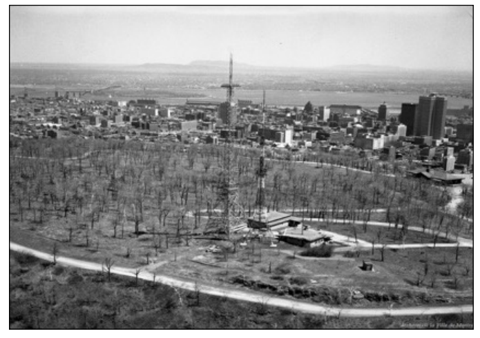
Figure 6. View of Mount Royal's denuded summit following the Morality Cuts.

As the Jungle was cleared, the city could state that their moralist agenda, especially morality in public spaces, had literally reached its summit, effectively demonstrating the limitlessness of morality—going "above and beyond" any height of the city, surpassing the natural environment.<sup>81</sup> For the parks department,