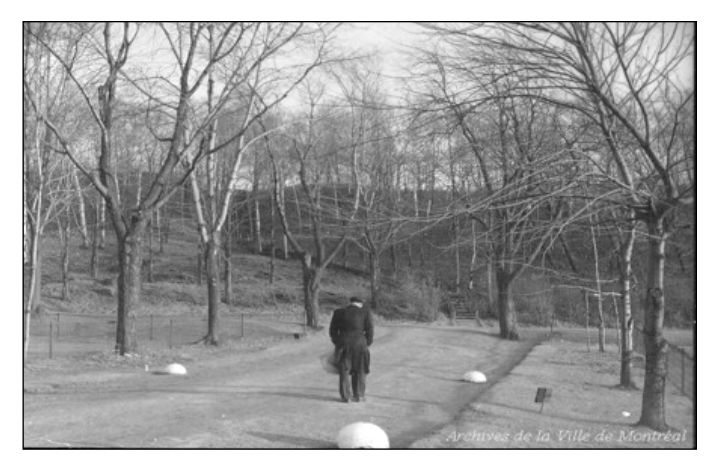
Figure 3. This snapshot was part of a photographic report produced on 18 November 1953, Parc du Mt Royal: Différents paysages. The report depicts various users and aspects of the park, notably hikers, squirrels, and patrons in the chalet's restaurant.

people who helped the police department catch "dangerous criminals" through a system of honorary police membership. By inciting citizens to partake in vigilantism and capture criminals, the city was not only fabricating a proactive policing stance, but more importantly, elaborating a greater distinction between the Same and the unfamiliar Other.<sup>30</sup> Regardless, these preliminary tactics did not satisfy individuals who devotedly sought a safer, cleaner, and more tranquil park.