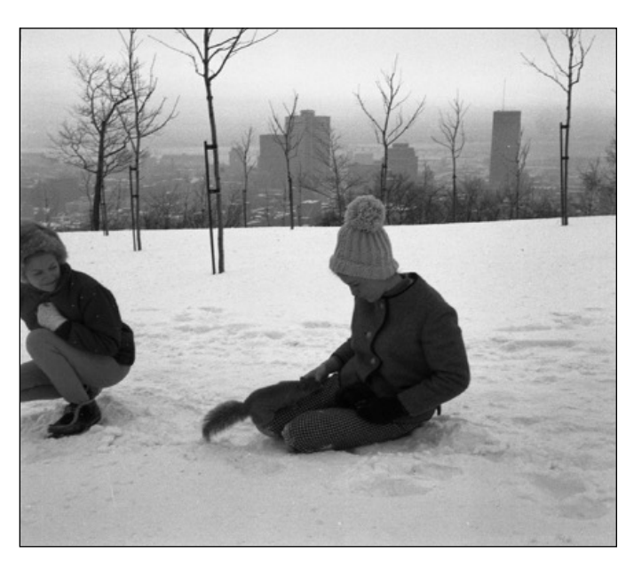
Figure 8. Deciduous trees in the background illustrate the abundance of newly planted Norway maples on Mount Royal on 26 January 1965.

on St-Joseph Boulevard and Pie IX Boulevard had supplied earth fill for the Mountain, ensuring soil supplies for planting and growing areas in the park to make it "proper for nicer-looking trees" 104—a step away from the transitory resinous trees used to rehabilitate the park. With this soil supply the park could therefore enter a phase of rehabilitation and "beautification" by planting more aesthetically impressive species. Montreal planted more trees than any city in the world in 1960. 105 By 1964 the forestry division began planting wide-ranging types of trees, Norway maples and silver maples, pines, spruce, oak, ash, and elm trees, for a total of 8,500 that year. 106