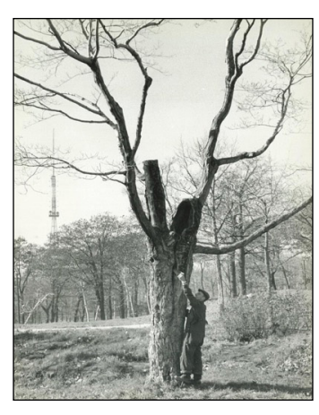
Figure 4. An employee of the city's forestry division analyzes the decrepit state of a tree in autumn 1960. Trees in such a state were numerous at the time in Mount Royal Park.

Nevertheless, the MPPA's comment reveals that they did not wholly reject plans for Mount Royal. Indeed, the Jungle aside, the ecology of Mount Royal Park had been progressively deteriorating. As sources reveal, little attention was given to the park's ecological well-being in the 1940s and 1950s. As Jean-Joseph Dumont, superintendent of the Montreal Parks Department's Forestry Division, stated in