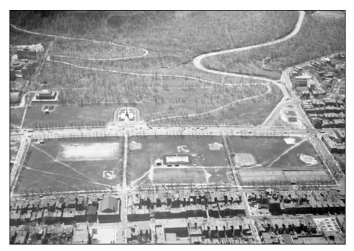
Figure 7: Aerial photograph taken on 10 May 1962 (compare with vegetation in figure 2). Construction of the new roadway was tied to cutting back the Jungle.

steepest slopes of the Mountain. 95 Most trees planted then were Canadian spruce or firs, depending on the shade. 96