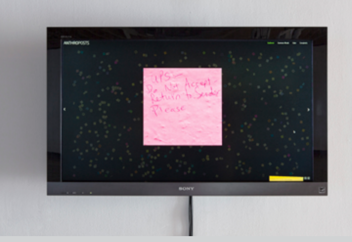
Marco Cadioli, Over Data, 2010

The Internet appeals to us as creatures who select and specify. Unhewn blocks of search bar beg for the refinement of our whittling keystrokes; images compel us to zoom in – and out – at will. So, at the level of contemporary reflex, it was