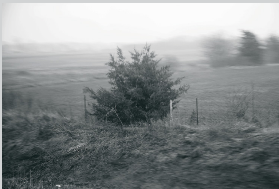
Untitled Photographic Pictures , 2015 inkjet print, 152 × 229 cm

In this series of photographs, Wright opens up a rich interpretive space by taking the motif of the empty landscape