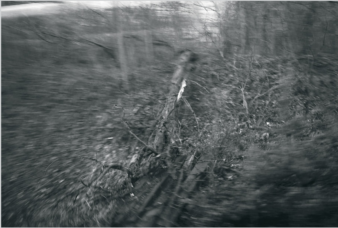
Untitled Photographic Pictures , 2015 inkjet print, 152 × 229 cm

and making it strange. Each photograph is a direct-from-camera snapshot taken through the window of a moving train. As he passes by the landscape, Wright makes a deliberate jerking motion with the camera that causes the otherwise clear, focused image to be interrupted. This destabilizing movement leaves the viewer continually distanced from the “original” landscape. Within the confines of the gallery space, these visual disturbances, or “knots,” are immediately apparent to the viewer; yet, the images, captured in a moment between documentation and abstraction, are not clearly revealed. At first glance – without consulting the exhibition text, for example – one might assume that the artist has digitally edited these images to arrive at an ideal formal state. However, the critical viewer will not read these photographs simply as either completely “untouched” or “altered,” but will consider the ways in which the photographic impulse itself is always already held in a tension between composition and incident. The queerness of Wright’s arrival of the image is related to his broader interest in shifting the conversation away from representation or iconographic content and toward process itself.