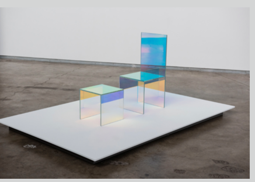
Dichroic Chair & Table, 2020

Darling Foundry, Montreal February 27–August 29, 2020