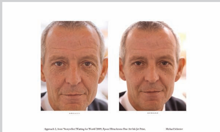
Approach 2, from "Storyteller/Waiting for Words" 2009, Epson UltraChrome Fine Art Ink Jet Print, Michael Schreier

The Or-Sarua installation is composed of seven 83 x 44 cm vertical images, each edged with a black border, that hang like banners between two cylinders. The allusion to