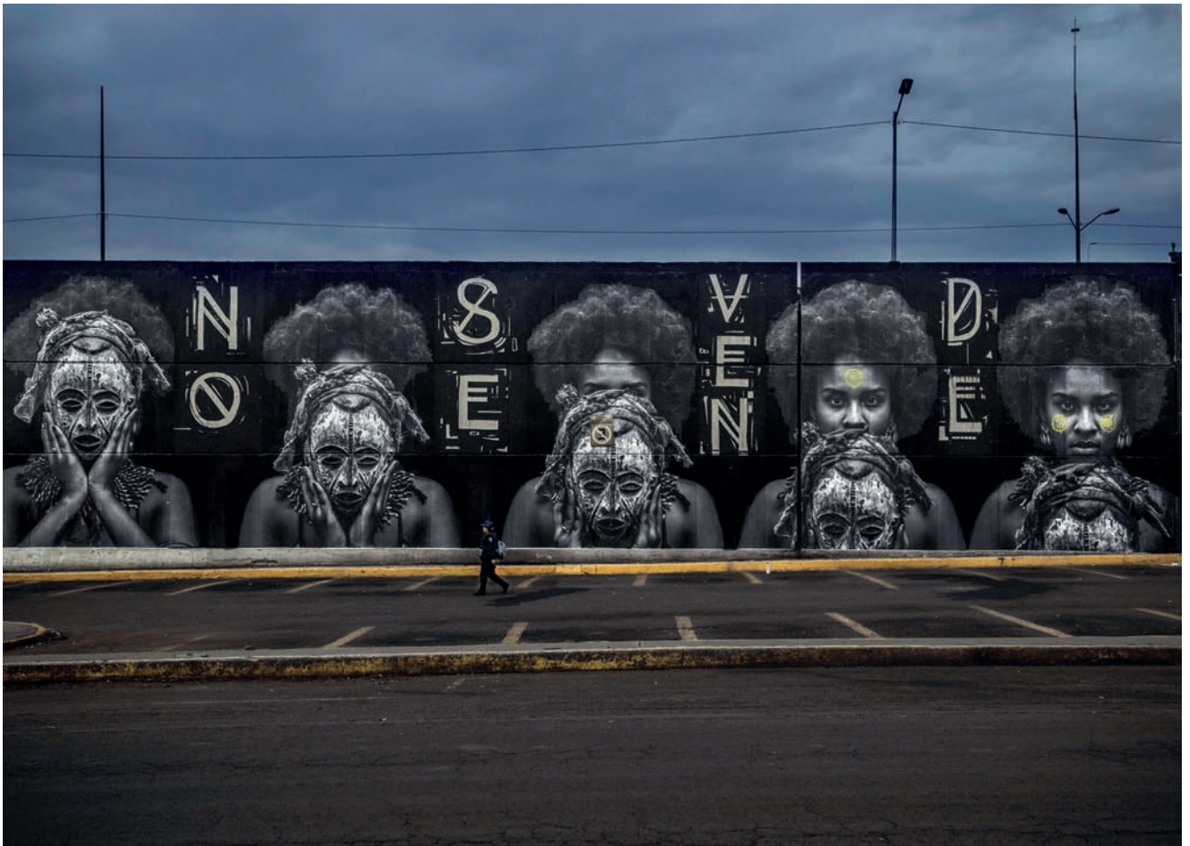
Raul Zito, NO SE VENDE , 2018. Hybrid of photographic collage and acrylic painting. Central Wall Project, endorsed by UN MX. Central de Abastos - Mexico city.