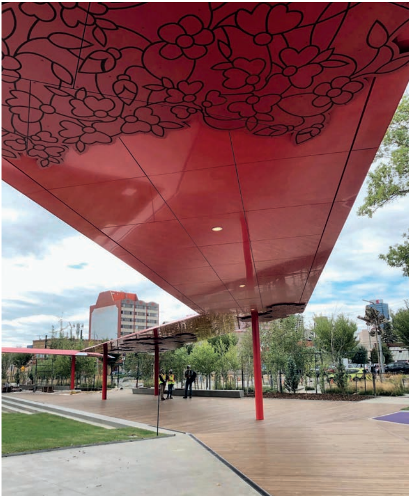
Tiffany Shaw-Collinge , kinistināw looking South West , 2020. Aluminum and trespaa, variable dimensions. kinistināw Park, Edmonton, AB.