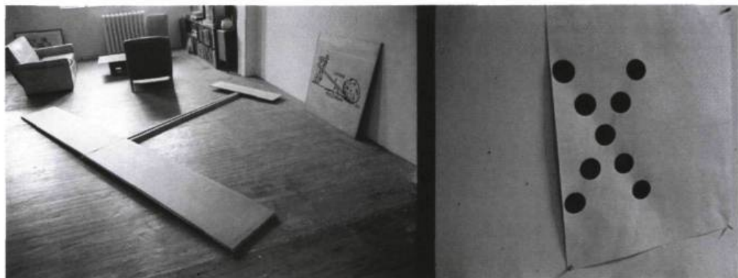
Artist's studio (two views), work in progress. October 1988.