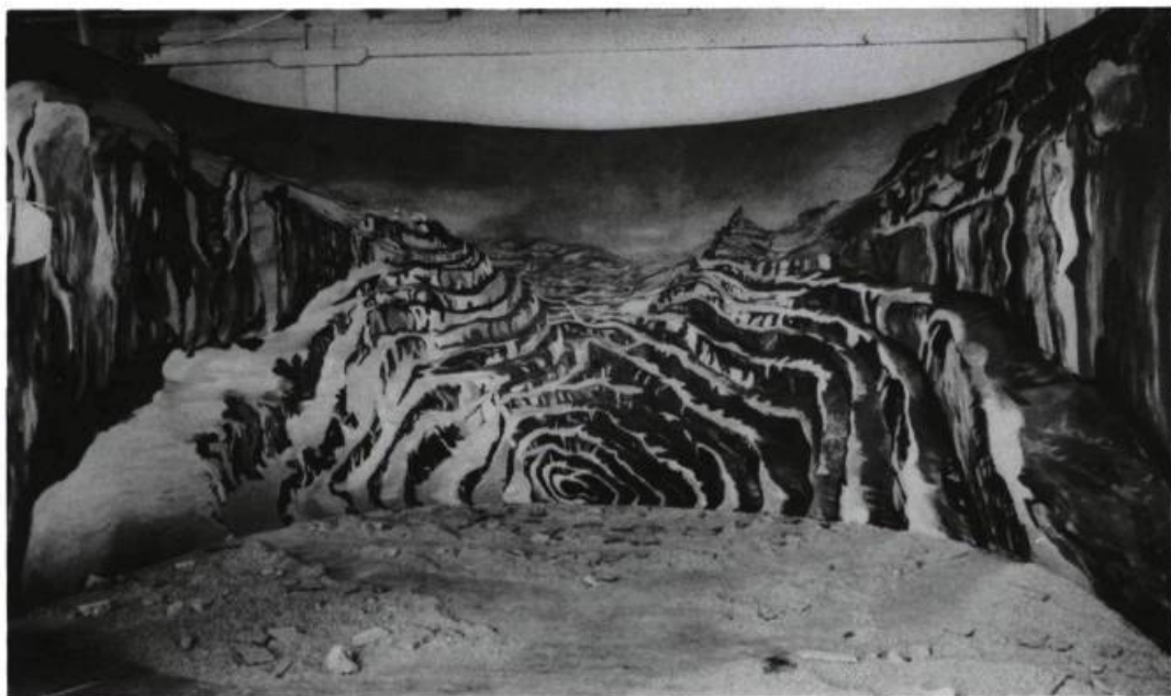
Kevin Kelly, A Reconstructed Landscape , 1989. Diorama, oil on linen; 2,7 x 9,1 x 9,1 m.

"Nihilism stands at the door : whence comes this uncanniest of all guests." Nietzsche