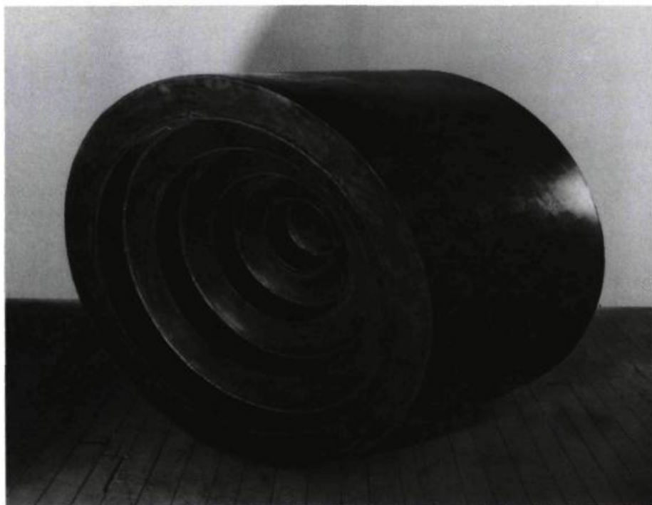
Liliana Berezowsky, Baldor II , 1989. Welded steel; 128 x 128 x 125 cm.

ure of faith, not necessarily in the theistic sense, but more with regard to a belief that any prevalent human act must have untold underlying signification or reason. Such a testing would also require a wider latitude for discussion than that which is permitted within the scope of this essay. Let it suffice then to cite a few of the numerous examples of the 'third state' phenomenon at hand. Leave the discovery of the rationale or the debate of inherent aporia to the diehard theoreticians :