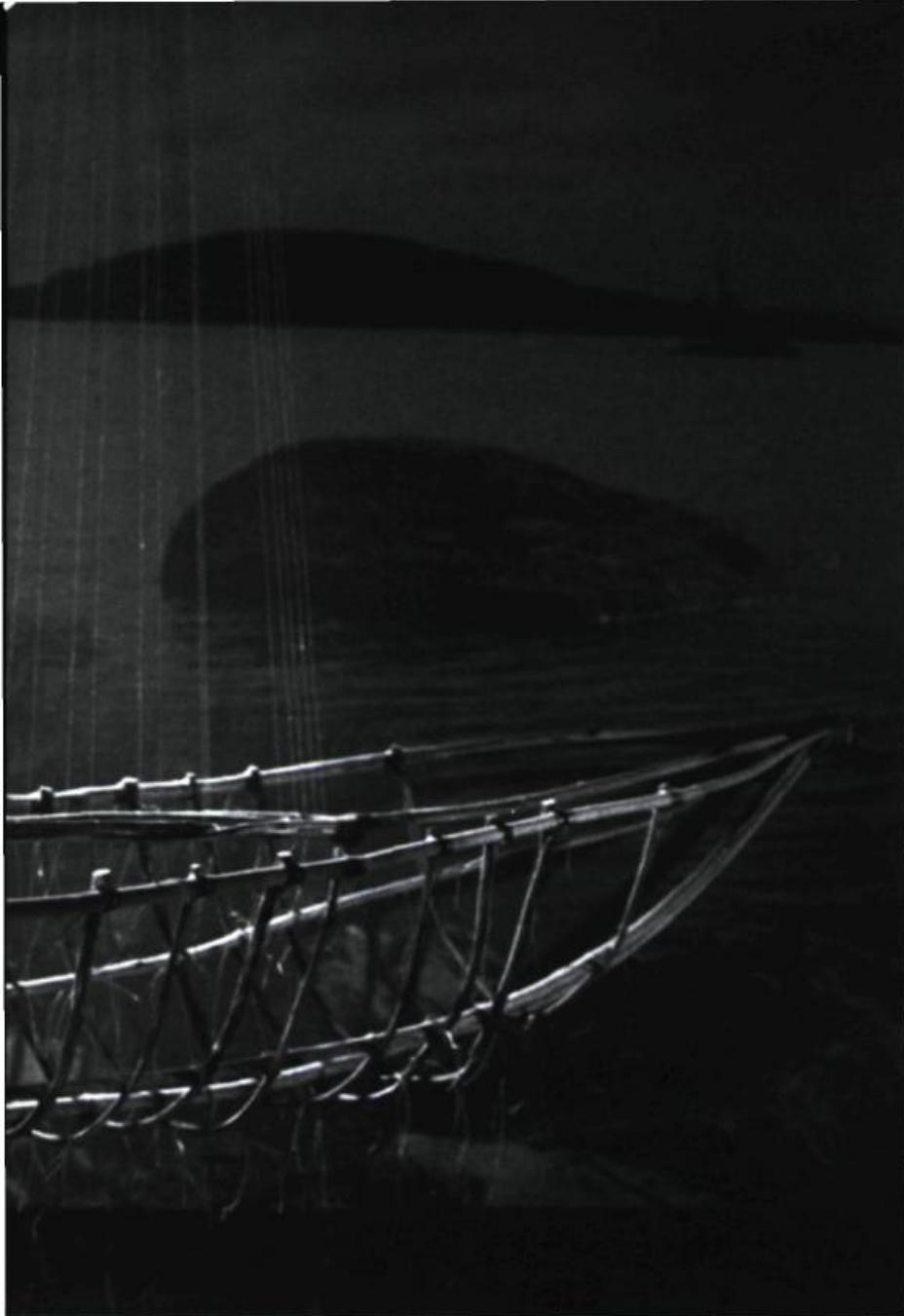
Kathryn Lipke, Silence , 1995.

they were mirroring the same experience from a male perspective. We never actually see the bird whose shadow is cast on an adjacent wall in the gallery. It is an evanescent witness to the experiences that life provides us, a shadowy afterimage of our unconscious, as illusory and intangible as life itself. By integrating natural elements essential to all life, such as water and earth and presenting these as the sites over which her assemblages hang or are placed, Lipke ultimately provides us with an environmental context that symbolizes our own dependence on nature for cultural survival. An environmental backdrop to Silence comprises a wall of handmade layered paper and clay with iron oxide and graphite added to build the colours. Its undulating forms are less characteristic in texture and coloration to paper than of the earth in its primeval, original state. The wall piece provides a counterpoint to the more literal elements and embodies a private sense of permanence and quietude, of a cathartic healing and spiritual presence.