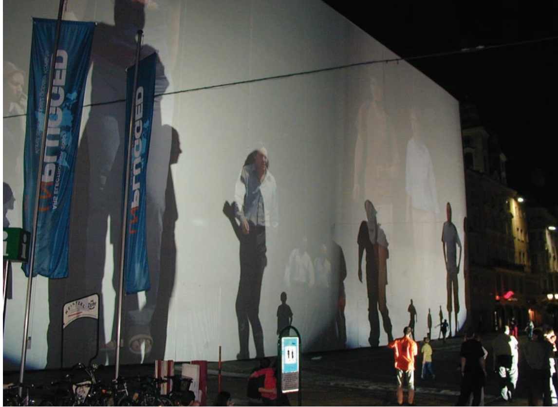
Relational Architecture: Body Movies, Rafael Lozano-Hemmer, Ars Electronica Festival, Linz, 2002.

the labels currently applied to media art projects and also to the popularity of certain forms of artistic creation. Since the birth of its Prix in 1987, the Ars Electronica team has been brought to incorporate new categories and eliminate older ones in order to respond to the changing trends in new media: while initially setting up very specific categories, the Prix has evolved into more imprecise terms such as 'Hybrid Art' or 'Digital Communities.' Remarkably these two categories have substituted those devoted to interactive art and net art (Net Vision and Net Excellence), which had been popular during the 1990s and the beginning of the 2000s. On the one hand, these changes in nomenclature and the way in which they were applied have not been without controversy. For instance, the disappearance of the 'Interactive Art' category followed a discussion over one of the awarded artworks, Mark Hansen and Ben Rubin's Listening Post (2002–2004), which, according to Erkki Huhtamo, could not be consi-