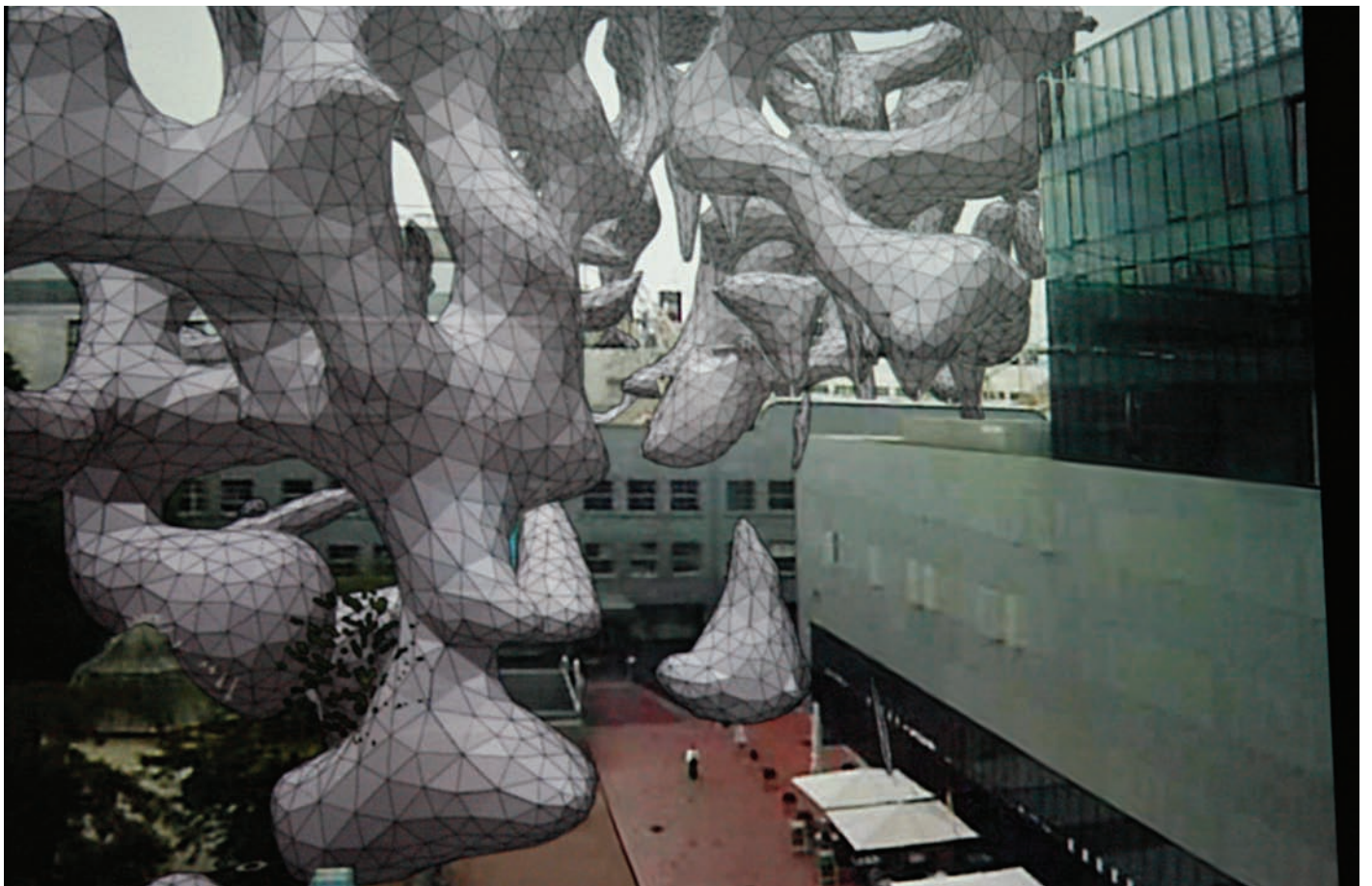
Corpora in S(igh)le, doubleNegatives Architecture, Ars Electronica Festival, Linz, 2009.

In 2004, Gerfried Stocker, one of the artistic directors of Ars Electronica, stated that the role of the festival had changed over the years: "It is now more or less impossible to present new things or to be aware of all the media art production in the world. So, the festival becomes more an intermediary, a catalyst. It is about bringing in at the same time, and the same place many interesting things and trying to generate a critical mass of interesting and