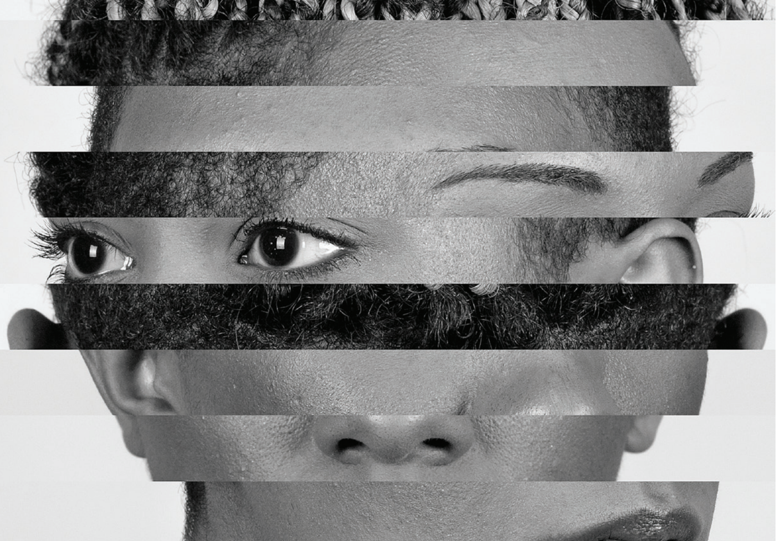
Rollin Leonard, still from 360° / Lilia 18 , 2013. 16:9 video.