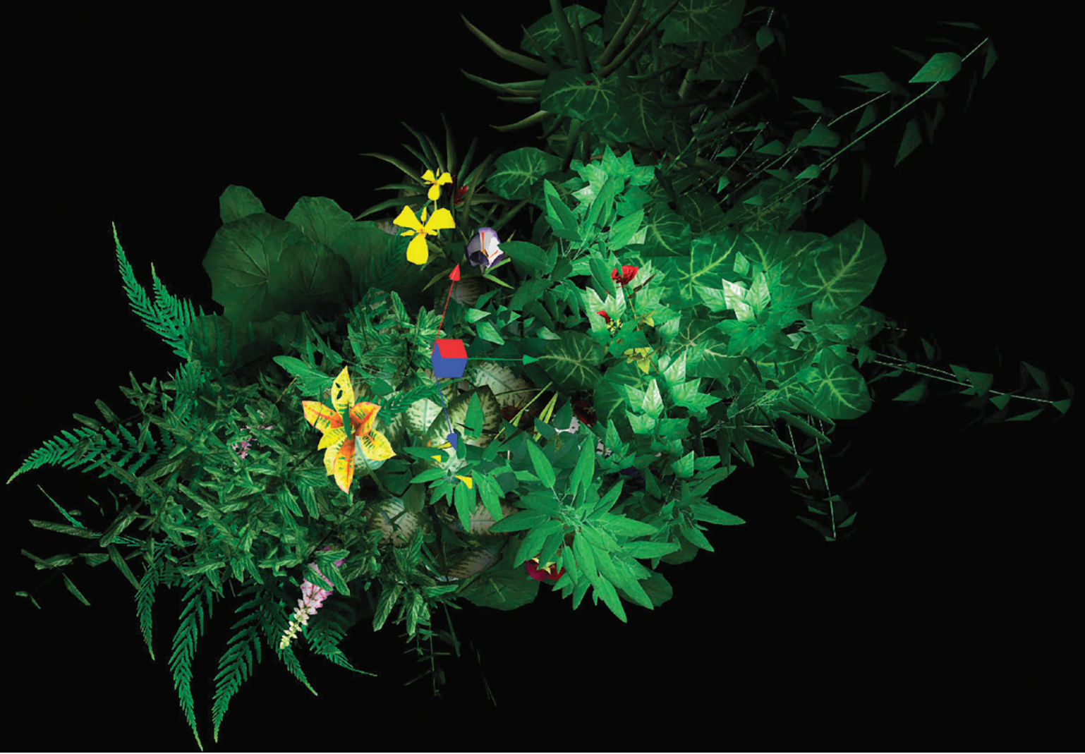
Rick Silva, still from Render Garden , 2014. Realtime 3D application.