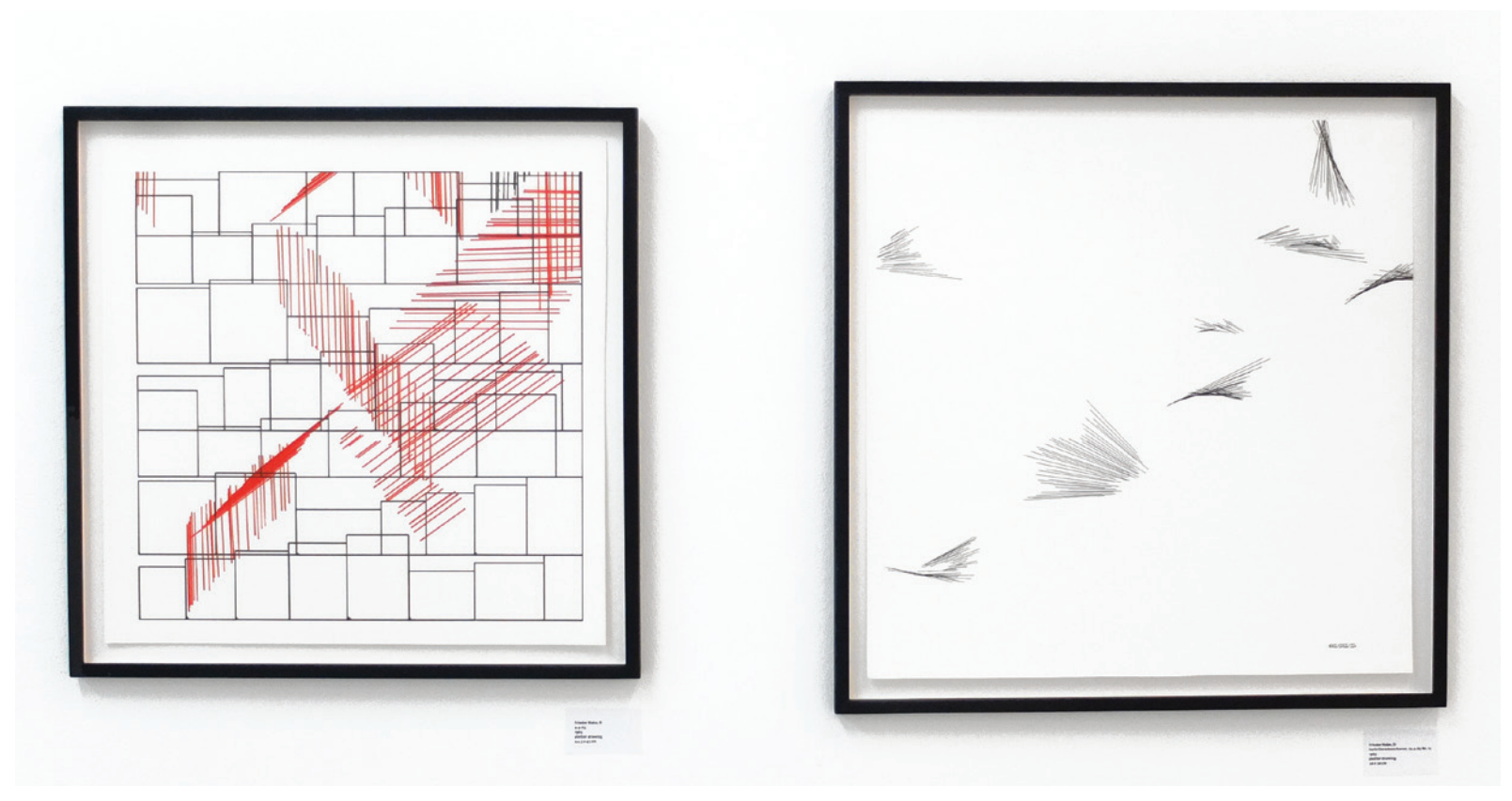
Aesthetica, Frieder Nake, 9.9.65, 1965; and Geradenscharen, 25.9.65 Nr. 12, 1965. Plotter drawings.