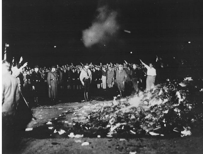
Opernplatz, Berlin book burnings (2)

One chilling scene early on in the story is the town’s collective burning of books in the town square. As the population gleefully threw books into the fire, the town’s Nazi leader boasted how the new Germany would rid itself of the communists and Jews, and their books. After the fire dies down Liesel goes to the smoldering pyre and retrieves one of the books that is still smoking. That becomes the book that propels her into her quest for literally gobbling up books.