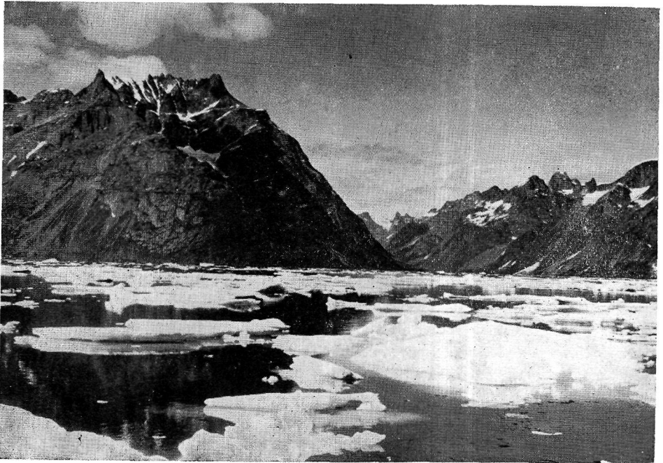
Summer pack-ice ( storis ), Prinz Christian Sund, south Greenland.

Fortunately, Godthaab is not only far enough north to be spared the effects of storis , but also far enough south to avoid the pack-ice from the north and west. It is also well located near the outer coast and so not troubled by serious local winter ice. It would seem that somewhere in this general locality is the most suitable site for a port from the point of view of freedom from obstruction by ice. It is interesting to recall that from the time of John Davis (1585) this fact has been recognized by sailors and that today Godthaab is the capital and main distribution point.