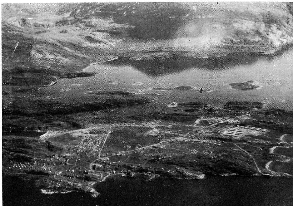
Godthaab, Greenland. Town and harbour looking east.