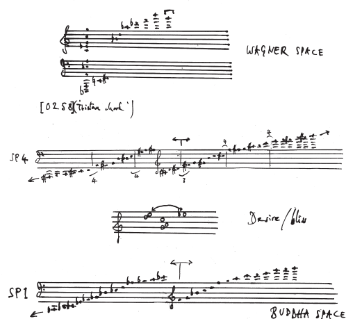
FIGURE 2. Harmonic spaces for Wagner and Buddha, conceived in August, 2003. (This document: February, 2007)

Shortly after, there is a low A played by a sampled trombone, set at a distance by the spatialiser; another, more distant, canal boat. This repeats at 35 second intervals, as opposed to the E flat's 25 second intervals. A sort of slow ostinato, background to the actors' entrance and dramatic encounter.