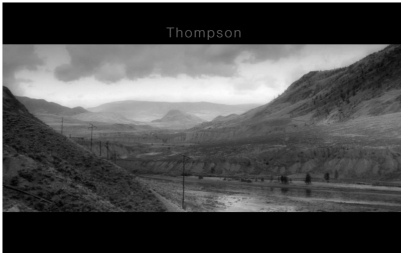
FIGURE 2 Christian Calon, Continental Divide , 2011, Thomson-Okanagan Plateau sequence.