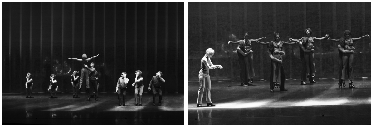
FIGURE 2 La vie qui bat, performance, Salle Pierre-Mercure, Montreal, February 18, 2011

In the choreography of Anne Teresa De Keersmaeker, she and Reich shared the same thinking about composition as process, and she used similar techniques (e.g., repeats and variations on motive) to building a parallel work in dance form. For this article, I did not have a chance to interview De Keersmaeker, so cannot comment on the specific constraints and challenges she might have faced working on the piece.