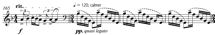
FIGURE 3 Scott Godin, Guided By Voices , mm. 165–172.

strings are closer together with five of them, I cannot simply push into the string to sharpen the clarity because I have a greater risk of hitting the other strings, especially since the string tension is lower than on the modern cello. Therefore, I tried to apply bow pressure closer to the bridge for the passage and I asked Scott if I could slur the notes because I found this combination best produced the legato and the clarity I was searching for. I also learned through this first new piece for five-string cello to accept and even enjoy a certain graininess and colour of the string sound that I don't usually have with modern cello.