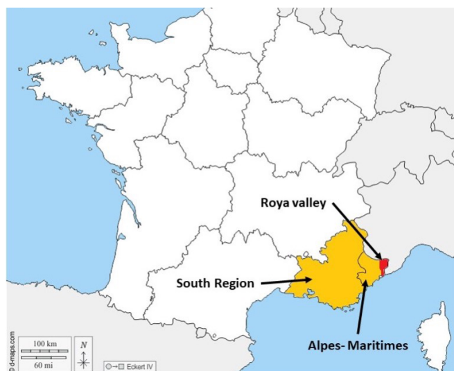
Figure 1. Localisation of the case study. Background: d-maps.com