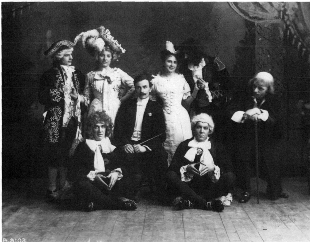
Cast of The Chimes of Normandy in Robertson Hall, 1904