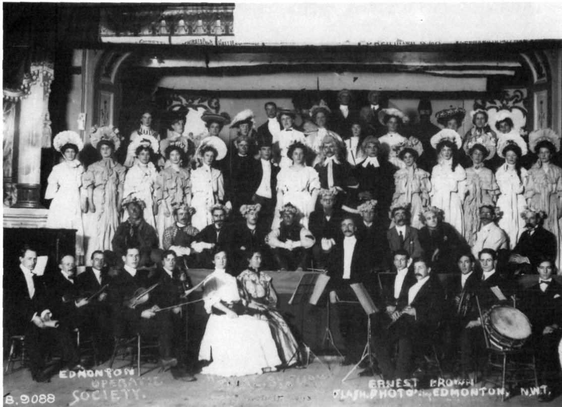
Cast of Trial By Jury in Robertson Hall, 1905