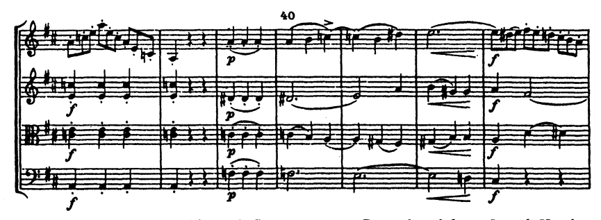
Example 1a: Haydn, op.20, no.4, first movement. Reproduced from Joseph Haydn: String Quartets opp.20 and 33 , ed. William Altmann 1985, by permission of Dover Publications, New York.

(or groups of two) were the rule, as four dance steps had to fit in two measures of music in 3/4 time (six beats equalled four steps). Haydn frequently uses fast tempi that undermine stately decorum, irregular patterns and accents that confuse metre, various types of asymmetry that disrupt balanced phrases, contrapuntal textures that obscure the articulations of regular phrasing, rusticities that subvert refined courtly manners, and temporal discontinuities that interfere with rhythmic flow (such as silences, fermate , and stubbornly repeating melodic fragments). Many of these procedures can be seen operating in the third movement of opus 20, no. 4 (see example 1b), especially irregular phrasing, an obscuring of the metre by rhythmic patterns and accents, and assumption of a rustic tone.