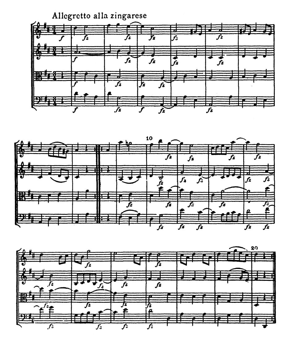
Example 1b: Haydn, op.20, no.4, third movement.

lation: after the return of the first half of the exposition in the tonic, there occurs an extended developmental passage, which eventually leads back to the first theme, followed by second theme and coda. The interpolated section sounds at the same time like a cadenza, a rondo episode, and a second development section,