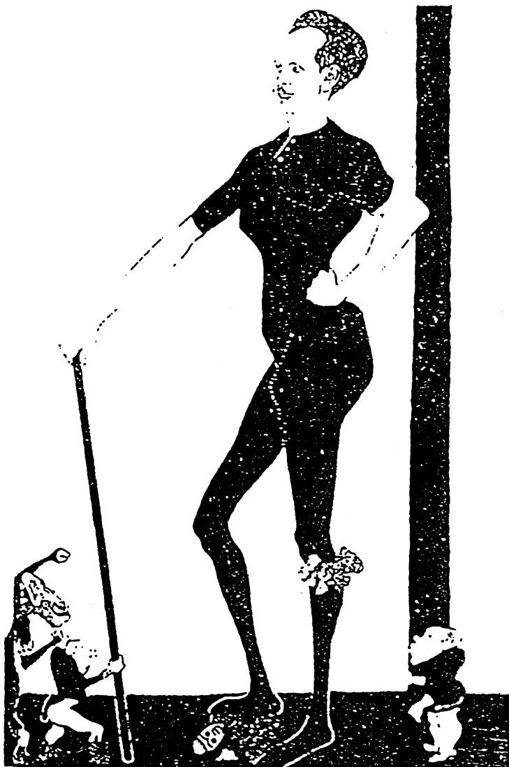
Figure 3: Richard Strauss.