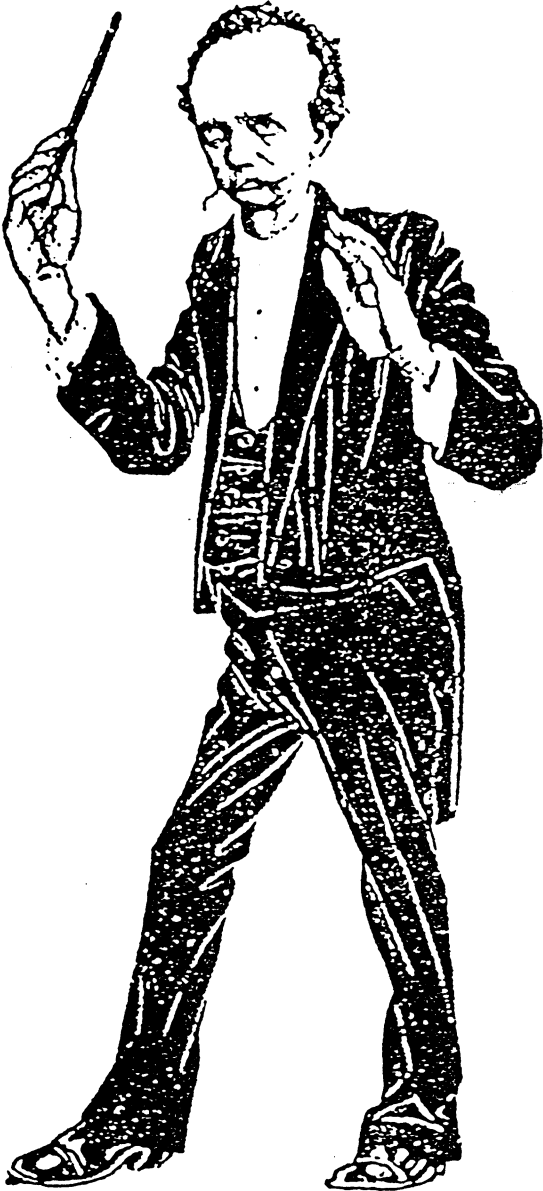
Figure 2: “Der Neurosenkavalier” (source unknown).