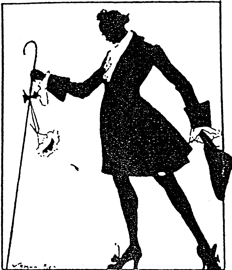
Figure 4: Richard Strauss.

be afraid of it – what profit is it?” Like Strauss, she surmises her own inevitable fate of becoming tediously dated and of being powerless against it.