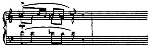
No. 3: 'Suffering' motif, no. 10

Example 1. "Suffering" and "Hammering" Motives of La Voix humaine [from Waleckx, "'A Musical Confession,'" 336–38]