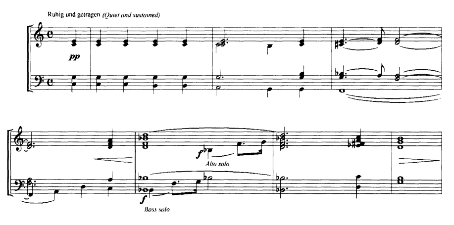
Example 5. Richard Strauss, Deutsche Motette , op. 62, mm. 1–7, harmonic reduction. © Copyright 1913 by Adolph Furstner. Copyright Renewed. Copyright Assignment 1943 by Hawkes & Son (London) Ltd. (a Boosey & Hawkes company) for the world excluding Germany, Italy, Portugal and the Former Territories of the U.S.S.R. (excluding Estonia, Latvia and Lithuania). Reprinted by permission of Boosey & Hawkes, Inc

The harmonic language of Richard Strauss's motet is unmistakably post-Wagnerian. An examination of the beginning of the motet illustrates this point (example 5).