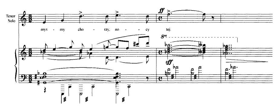
Example 4. Karol Szymanowski, Third Symphony, op. 27, mm. 21–23, harmonic reduction. © 1925, 1953 by Universal Edition A.G., Wien, revised version © 1973 by Universal Edition A.G., Wien © renewed All Rights Reserved Used by permission of European American Music Distributors LLC, U.S. and Canadian agent for Universal Edition A.G., Wien

diminished seventh chord (B \nmid -D \nmid -F \nmid -A \not\equiv) which does nothing to clarify the tonal-harmonic orientation of the phrase, as one would conventionally expect at a point of cadential repose.