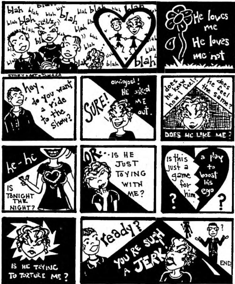
Fig. 4 - Tamara Rae Biebrich, nEuROTIC Girl, no. 2, 1996.