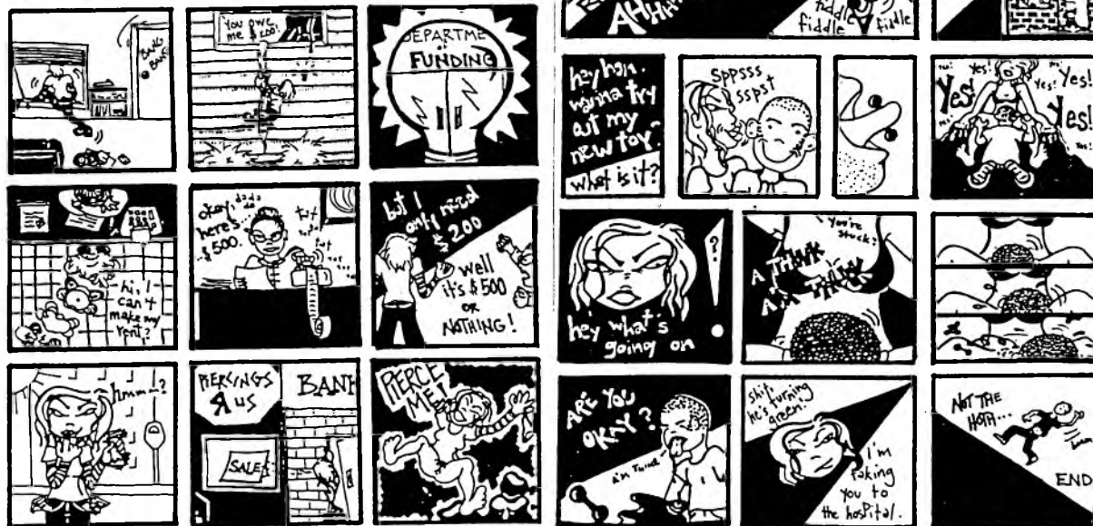
Fig. 2 - Tamara Rae Biebrich, nEuROTIC Girl, no. 2, 1996.