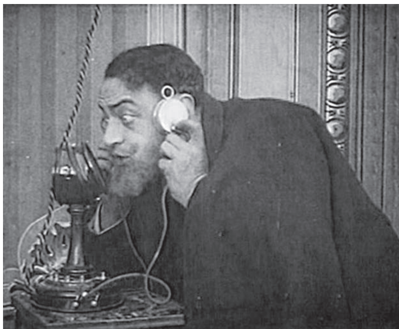
Figs. 4-5. Le médecin du château , Pathé, 1908.