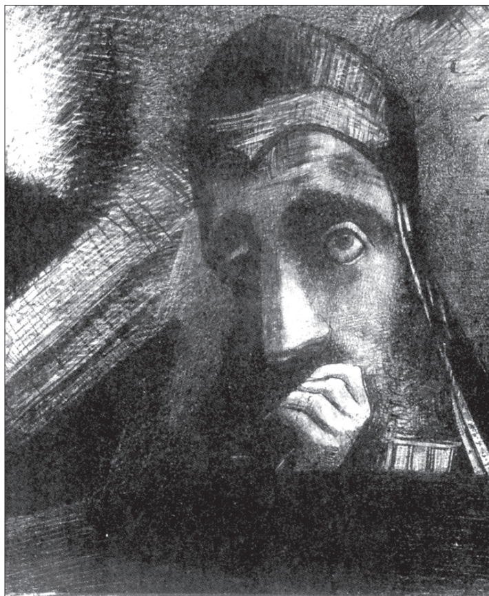
Fig. 2. Odilon Redon, "Dans mon rêve, je vis au Ciel un VISAGE DE MYSTÈRE," Plate 1 from Hommage à Goya , 1885.

intelligibility. The images are paired with captions that structure the sequence, but the series permits undetermined associations and reversals, allowing a folding of the different faces—the faces of difference—and the affects they provoke.