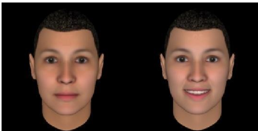
Figure 1. Neutral-face agent and smiling-face agent.

Two 3D male virtual agents were designed to convey either a neutral facial expression or a constant smiling expression (see Figure 1). The audio speech of both agents was generated using the IVONA Text-To-Speech engine (American English-Joey, default speed). The virtual learning environment served as an interactive platform for the virtual agent to deliver lessons on basic computer programming (see Figure 2).