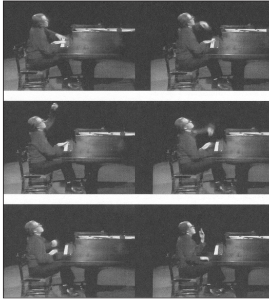
Figure 2. The final moments of Contrapunctus 14 , in Bruno Monsaiegon's 1980 film An Art of the Fugue . Glenn Gould Magazine 8, no. 1 (Spring 2002): 34. A video of this performance, with all of Gould's conducting gestures, can be viewed at http://www.youtube.com/watch?v=iDSAXtsDB5k .

388). Perhaps the “excruciating ... agonizing” pace ( ibid. ) was also at the root of Schuller's “wrong-headed” comment.