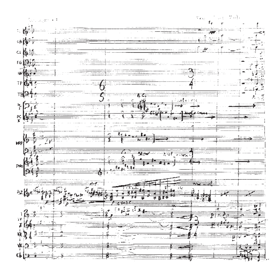
Example 6. Theodore Antoniou, Concerto for Tambura (Bouzouki) and Orchestra, bars 1–6, with kind permission from the composer

conventions of the Greek National School based largely on Kalomoirēs's reception of Wagner. His quest for his own voice led him to explore new ways and means to integrate the elements of Greek traditional music into contemporary composition. A characteristic example in Antoniou's later work is the Concerto for Tambura (Bouzouki) and Orchestra (1988).<sup>23</sup> The composition presents a compelling example of cultural blending and stylistic métissage , which can be seen on the very first page of the work. Antoniou demands new and usual techniques from the soloist, turning the sound colour of the bouzouki into a thematically charged musical gesture (see bar 3 in example 6).