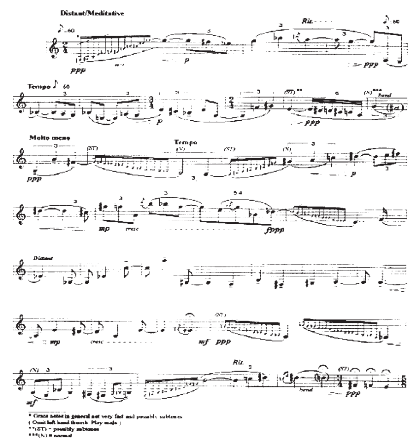
Example 7. Theodore Antoniou, Lament for Manos , for solo clarinet (1995), bars 1–34, with kind permission from the composer

traditional lament songs as the basis for a number of instrumental works. Lament for Michelle for solo flute (1988) and Lament for Manos for solo clarinet (1995) are characterized by the exploration of timbres and techniques associated with the melodic world of folk music practice on the traditional type of these instruments. The latter work was written for Manos Hatzidakis (1925–94), one of the most influential Greek songwriters and composers of the twentieth century, an important promoter of the rebetika style and a close friend of Antoniou. In this work, the nuances of the traditional laments are recalled by typical short slips (indicated on the score by the word bend , see bar 9 in example 7). The slow appoggiaturas (as noted with the composer's directions on the score) reconstitute on the clarinet the characteristic sobs of these dirges. The subtones, the short slips, the slow appoggiaturas, etc., are associated with the traditional music practice from Greece and are so successfully woven into the extended techniques of Western contemporary music that it is difficult to separate the two practices.