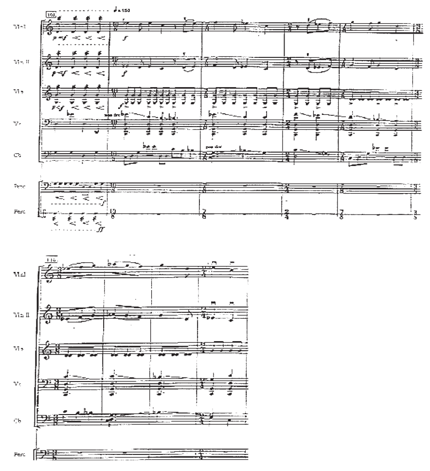
Example 5. Theodore Antoniou, Concerto for Strings , for string orchestra and percussion (1992), bars 105–13, with kind permission from the composer

both the Octet (1986) and the String Concerto (1992) employ melodic material organized in duple and triple rhythmic units that are typical of traditional music in Greece and indeed throughout the Balkan peninsula: for example 5/8 (3 + 2), 7/8 (3 + 2 + 2), or 9/8 (3 + 2 + 2 + 2) (see bars 106–13 in example 5).