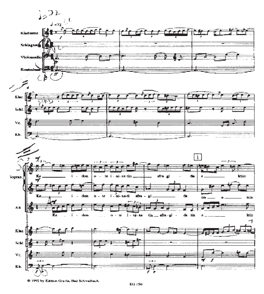
Example 3. Dimitri Terzakis, Das sechste Siegel , for mixed chorus and chamber ensemble (1987), bars 1–10, with kind permission from the composer. (The manuscript markings in the example were made by Theodore Antoniou, who used the score to conduct the work.)

material is clearly evident in the style of his music, Terzakis's use of microtones and modes does not refer directly to the style of the tradition from which it is derived. Terzakis dedicated this work to Ligeti to honour the leading role he played in the development of avant-garde music. The dedication also suggests that Terzakis's ability to develop melodic complexity based on Byzantine music is analogous to Ligeti's development of rhythmic complexity based on the music cultures of sub-Saharan Africa. Be that as it may, Ligeti and Terzakis take significantly different approaches. Whereas Ligeti adopts a typically Western attitude in seeking the exotic to develop his technique, Terzakis and Adamēs turn inward, examining the resources of their own culture.