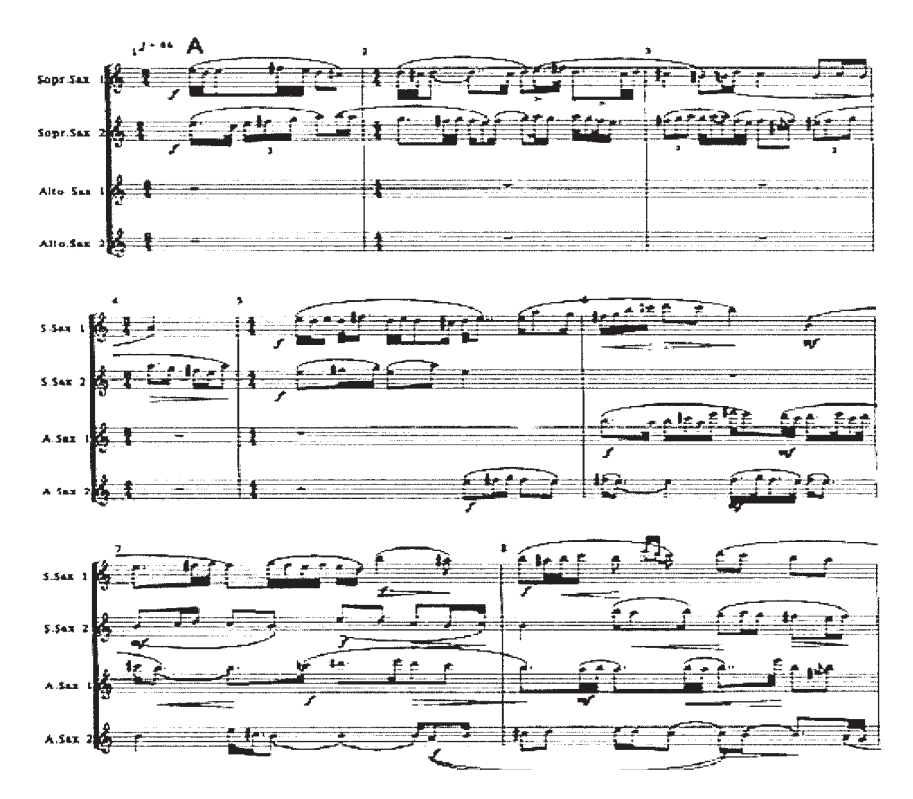
Example 2. Michales Adames, Kalophōnikon , for two soprano saxophones and two alto saxophones (1988), bars 1–8, with kind permission from the composer.

added a unique character in their personal musical styles. For example, the title of Kalophōnikon (1988) by M. Adamēs refers to the virtuosic genre called "Kalophōnia," which developed in the Eastern Orthodox liturgical tradition, from the fourteenth century onwards. The main characteristics of this genre are the sophisticated, melismatic arches (present in all four voices in example 2), the frequent transition of modes and the vocal ranges, as well as the repetition of syllables, words, and phrases, and the use of anagrams, creating a shifting sense of meaning for the attentive and knowledgeable listener. Adamēs's music expands his monophonic source material into a polyphonic genre. The contrapuntal melodic lines give the impression of both a new structure and a new process based on the Byzantine musical tradition.