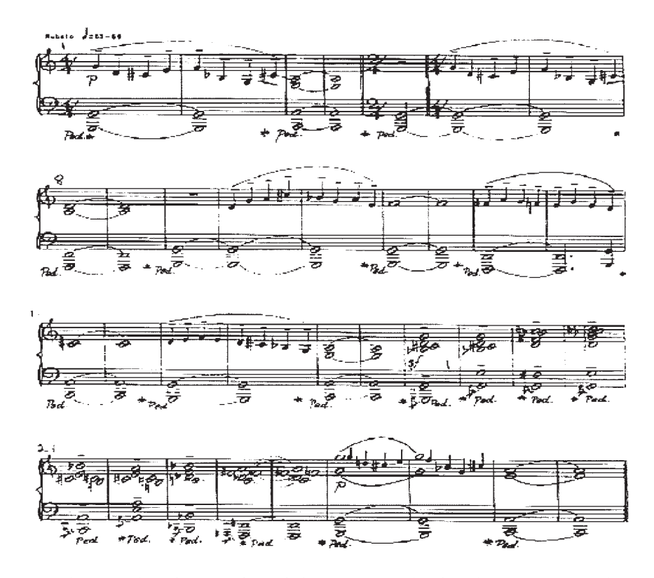
Example 4. Kyriakos Sfetsas, To fos tes kaktou (Cactus Light), for solo piano (1980–83), bars _{1-35} , with kind permission from the composer

Kyriakos Sfetsas, renowned for his left-wing views, moved to Paris in 1967 following the imposition of the military dictatorship in Greece. He studied composition, analysis, and conducting with Max Deutsch (1892-1982) and sought mentorship and guidance from Xenakis and Nono. He has written music in a variety of styles, but his most effective works are those that fuse the characteristics of Eastern Mediterranean music with jazz and avant-garde techniques. A characteristic example can be found at the beginning of To fos tēs kaktou (Cactus Light, 1980-83). The melodic line in the Introduction is based on the second plagal mode from the byzantine tradition (also known as magâm Hicaz) on A (A, B flat, C sharp, D, E, F, G, A). The pedal notes accompanying the melody derive from the Greek Orthodox liturgical tradition. Superficially the music may appear to be in D minor. The tonal centre is in fact A (magâm A Hicaz). This is emphasized by the motive at bar 15, where F sharp and F lean towards the fifth and seventh degrees of the mode—a characteristic technique of Eastern Mediterranean and Byzantine music (see example 4). The phrase ends on A with a monophonic texture at bars 21–22 and is followed by a series of "Western" clusters.