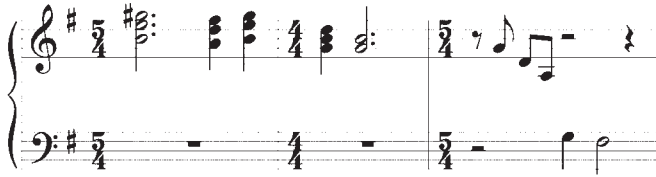
Example 1. Court and Spark , opening gesture, or “chords of inquiry”