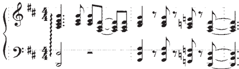
Example 4. Final measures of “Free Man in Paris” and the introduction to “People’s Parties”

that enhance the meaning of the text, carrying such contextual weight that the few cadences that occur on G are rendered almost impotent by comparison, further weakened by the addition of major sevenths and ninths. Ultimately, A triumphs over G in the fourteen-measure tag at the end of the song. While the strings play a plaintive melody in 3/4 time accompanied by an A minor pedal, one hears the piano’s right hand playing quarter-note quadruplets on a G triad against it in a four-against-three rhythmic pattern (example 5). Although the quadruplets are an almost visual portrayal of the lyric “I called out to be released,” they are strikingly reminiscent of the “knocking” triplet figure in the introduction to “Court and Spark.” However, the roles have been reversed here: the protagonist, not her lover, is knocking or pounding on the virtual doors or walls that imprison her. Chillingly, the knocking gradually slows, weakens, and disappears completely, swallowed by the A minor harmony that carries the final four measures.