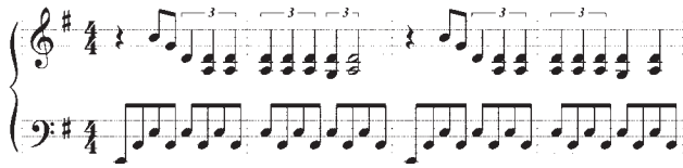
Example 2. The “knocking” triplet figure, “Court and Spark” mm. 4-7