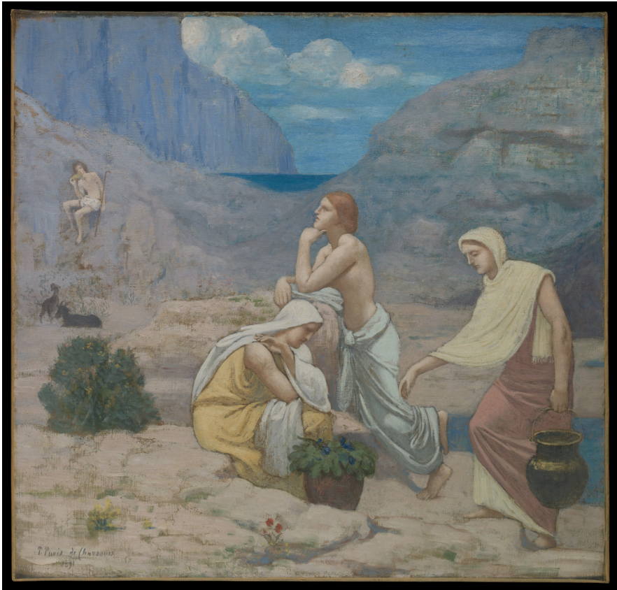
Figure 1: Pierre Puvis de Chavannes, Le Chant du berger , 1891; Metropolitan Museum of Art, New York City. https://www.metmuseum.org/art/collection/search/437344

Beaux-Arts in his hometown of Lyon. While he is relatively little known today, at least among the general populace, Puvis was a leading figure of his time, recognized mainly for his public art: grand-format classicizing commissions for Lyon, Paris (the Panthéon, the Sorbonne, and the Hôtel de Ville, among others), Amiens, Rouen, Poitiers, and even Boston (the Public Library). Indeed, such was Puvis's popularity that his paintings were applauded by a cross-section of polite society: conservative critics, the avant-garde, royalists, Republicans, and radicals. To the French left-wing leader Jean Jaurès (1900), for example, Puvis inaugurated democratic socialism; Marius-Ary Leblond, the pseudonym of a pair of cousins from the French colony of Réunion, extended the analogy, considering Puvis's work the epitome of "the happiness of communist life" (Leblond 1905, xiii–xiv). In stark contrast, the nationalist author and politician Charles Maurras (1895) understood the painter to signify an originary Frenchness, an ideal of enracinement that helped counter a prevailing foreign influence in fin-de-siècle art and culture by reference to the purification of a classical spirit and the dignity of the ancients.