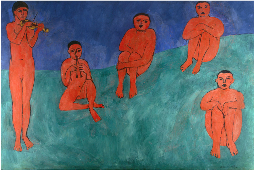
Figure 3: Henri Matisse, La Musique , 1910; The Hermitage, St. Petersburg. © Succession H. Matisse/Copyright Agency, 2022. https://www.hermitagemuseum.org/wps/portal/hermitage/digital-collection/01.+paintings/28424

carved out of limestone at a height of about 43 centimetres, a width of 20 centimetres, and a depth of 26. With smooth shoulder-length hair (presumably a wig) tucked behind relatively large ears, this adult male squats on the ground, knees drawn up in front of the chest, arms crossed and placed over them. His body is largely covered by a cloak, so that most of the detail is reserved for the face: rounded eyes with what looks like prominent liner on the upper lids, ridge-like eyebrows, a broad nose, wide mouth, and pursed, gently upturned lips. Feet are also prominent, flat on the ground with long toes splayed forwards. The overall impression is of a compact, weighty body, a “closed” physical form, yet one with a non-intimidating appearance.