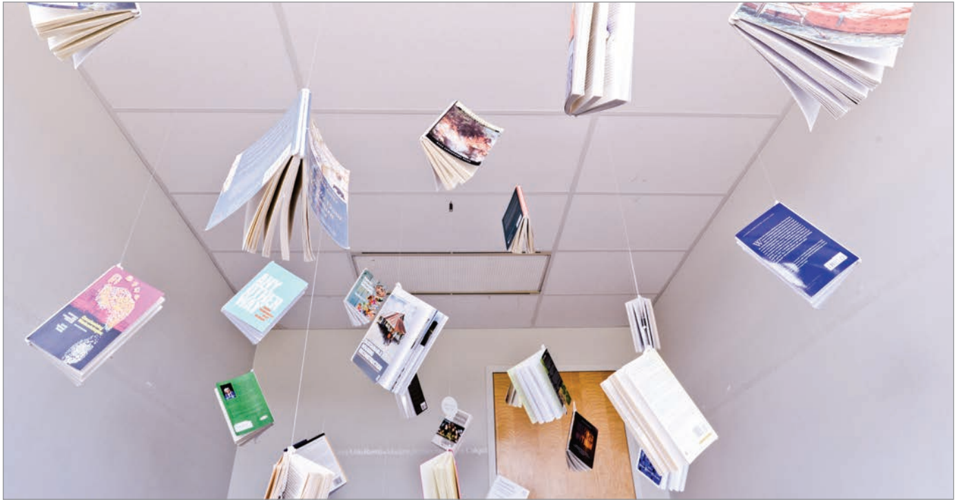
FIG. 6. "WHAT BINDS US" INSTALLATION IN DAYLIGHT. | AMINA LALOR.

faculty was overwhelming. We received emails, Facebook messages, and were stopped in the hallways of Waterloo Architecture by professors and school-mates who made comments such as the following: