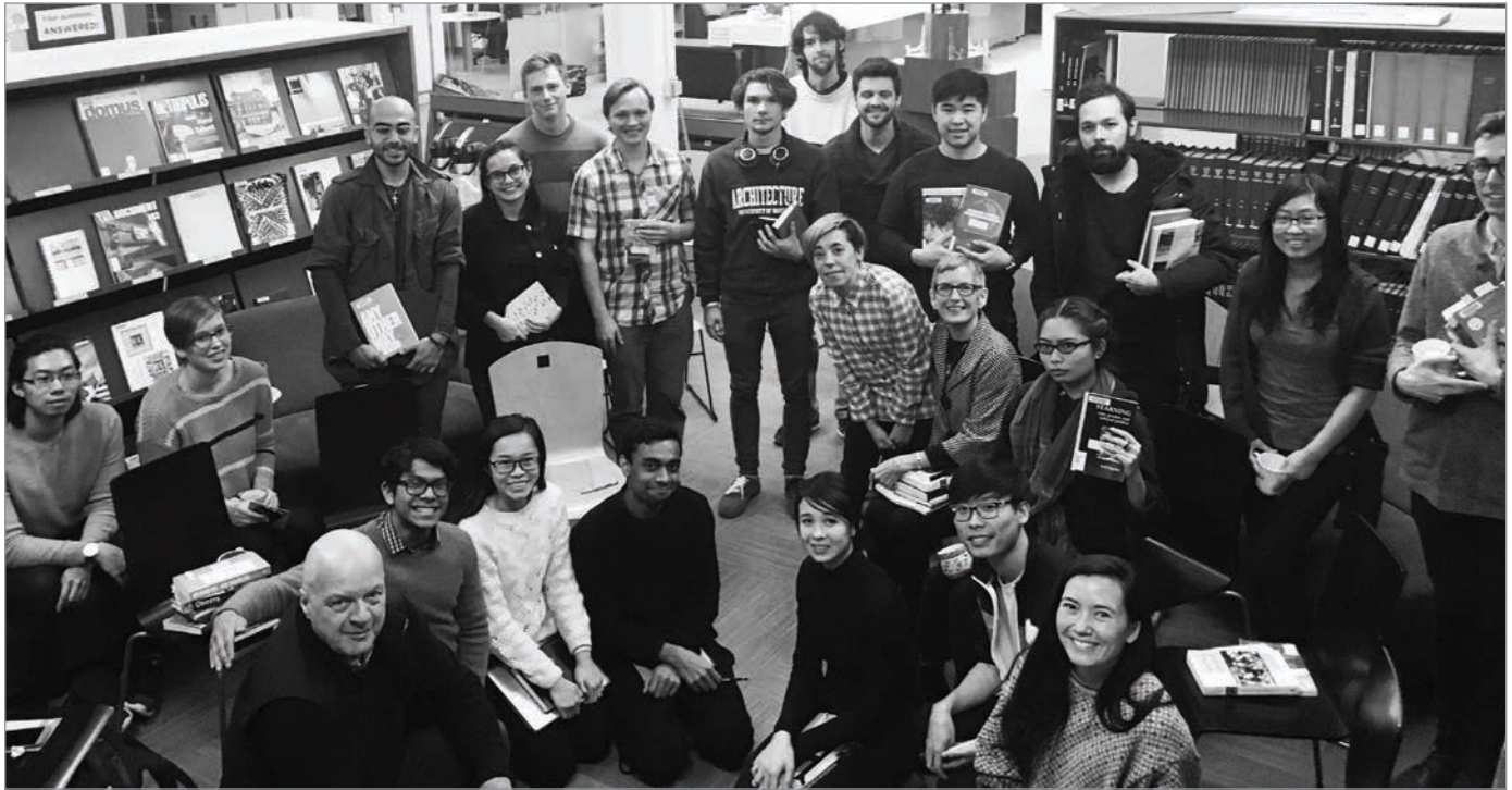
FIG. 7. A GATHERING OF STUDENTS, STAFF, AND FACULTY AT WATERLOO ARCHITECTURE TO DISCUSS THE THIRTY BOOKS INCLUDED IN THE "WHAT BINDS US" INSTALLATION ON NOVEMBER 9, 2017.

thirty books have since been donated to the Musagetes Architecture Library at the University of Waterloo. "What Binds Us" is an ongoing project. We continue to encourage additions to our alternative reading list through an open-source document. 31 Further, we continue to host conversations, events, and film screenings centred on the themes highlighted by these titles (fig. 7). 32