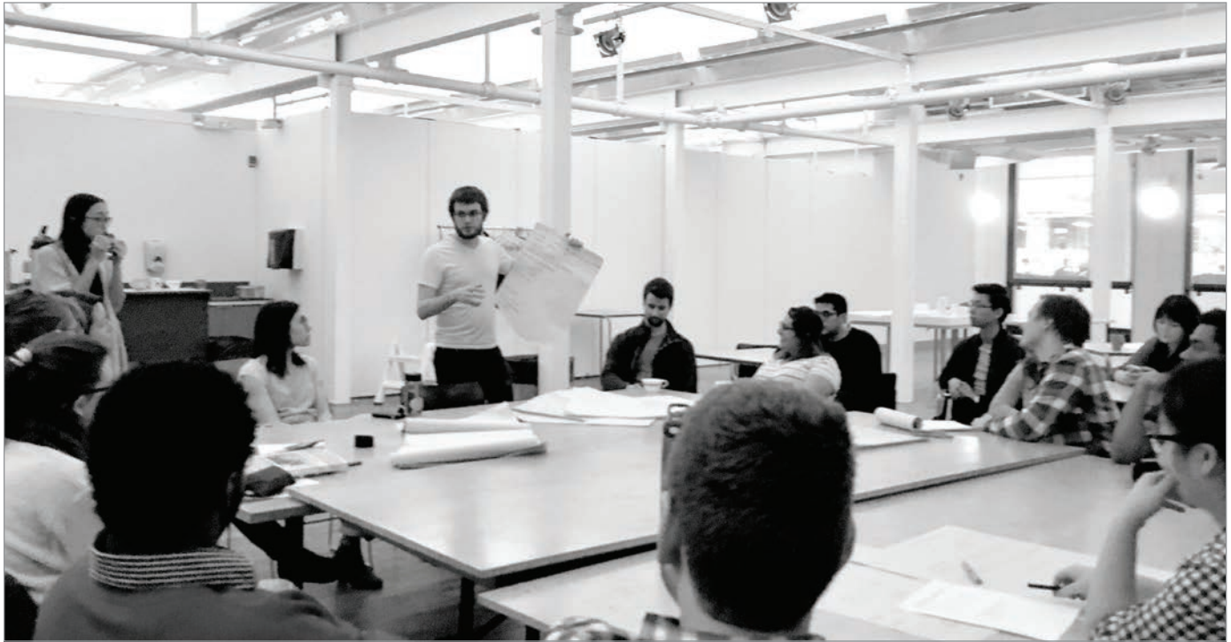
FIG. 4. GROUPS PRESENTING THEIR PROPOSED COURSE SYLLABI DURING THE "EXPANSION PACK" SYLLABI WORKSHOP ON MARCH 22, 2017.

In the previously mentioned study by Gürel and Anthony, their survey of textbooks assigned at leading American architectural schools revealed that the contributions of women and minorities were minimally included. 7 Despite the growing body of scholarship looking at non-Western, minority, and women architects, schools and textbooks lag behind in covering their contributions.