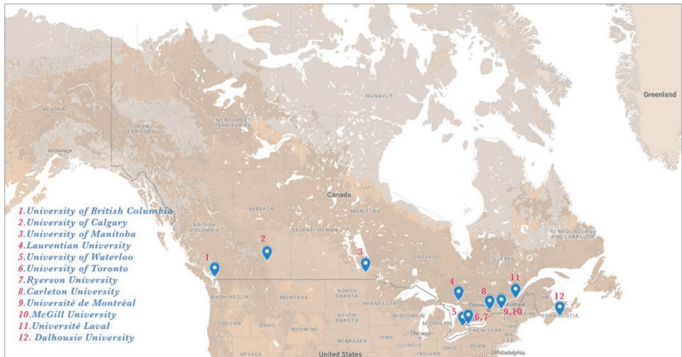
FIG. 2. CANADIAN SCHOOLS OF ARCHITECTURE LOCATED ACROSS CANADA.

agreements to share the land, for all to benefit from it. For most of us in Canada, it is because of these treaties—and their subsequent violations—that we are able to call this land home. We are all treaty people, both Indigenous peoples and settlers, historic and recent. But we forget this, or we are never taught it to begin with.