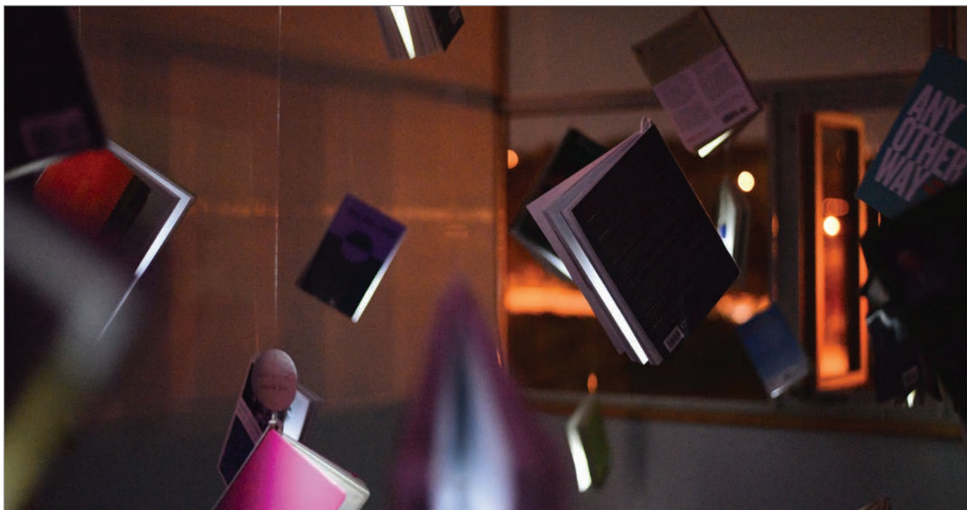
FIG. 5. "WHAT BINDS US" INSTALLATION AT THE ONTARIO ASSOCIATION OF ARCHITECTS MOVE PARTY ON SEPTEMBER 15, 2017. | AMINA LALOR.

education of the architect? How can we expose the biases and exclusions of the Western canon without discarding it altogether?" 8 She goes on to propose, as a starting point, to recognize that we are not trying to create a new canon out of the marginalia—the goal is not a new, alternate orthodoxy. The point is to show the interconnectedness of ideas, events, and voices. 9