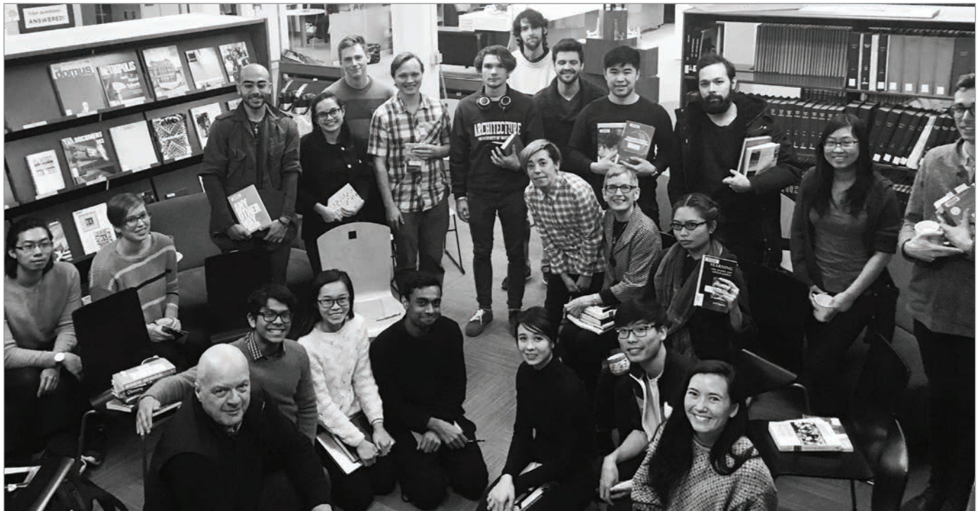
FIG. 7. A GATHERING OF STUDENTS, STAFF, AND FACULTY AT WATERLOO ARCHITECTURE TO DISCUSS THE THIRTY BOOKS INCLUDED IN THE “WHAT BINDS US” INSTALLATION ON NOVEMBER 9, 2017.

thirty books have since been donated to the Musagetes Architecture Library at the University of Waterloo. “What Binds Us” is an ongoing project. We continue to encourage additions to our alternative reading list through an open-source document. 31 Further, we continue to host conversations, events, and film screenings centred on the themes highlighted by these titles (fig. 7). 32