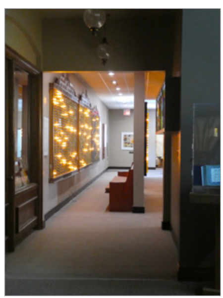
FIG. 3. ENTRANCE TO THE MEMORIAL LOUNGES FROM THE SOUTHWEST.