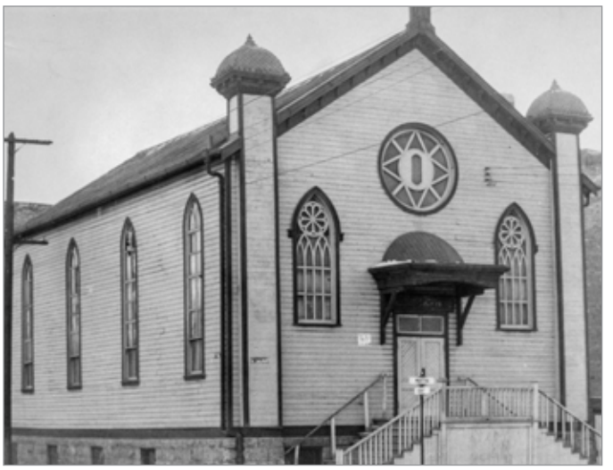
FIG. 7. EXTERIOR AND FRONT ENTRANCE OF ROSH PINA SYNAGOGUE (1893). | CREDIT JEWISH HERITAGE CENTRE OF WESTERN CANADA; PHOTO 30131.