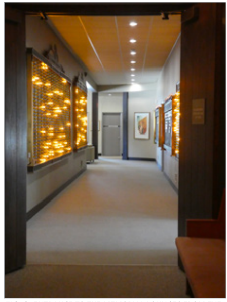
FIG. 2. ENTRANCE TO THE MEMORIAL LOUNGES FROM THE SOUTHEAST. | SHARON GRAHAM, FEBRUARY 2021.