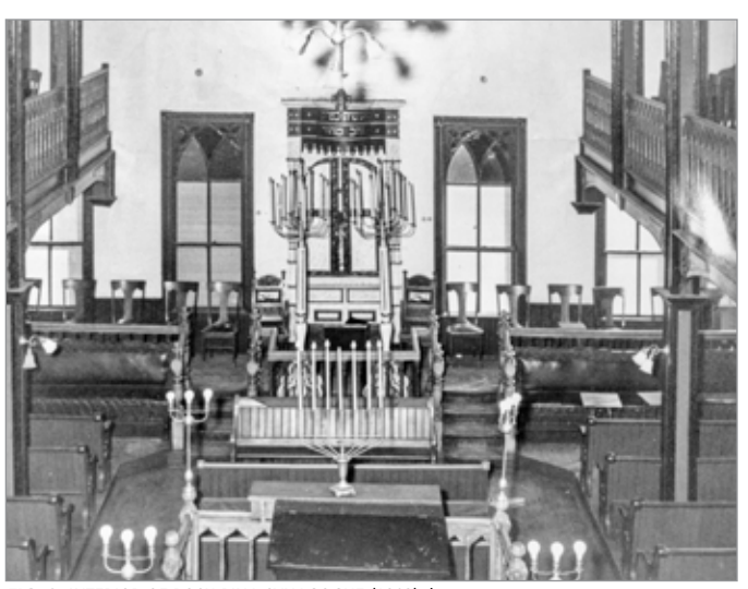
FIG. 8. INTERIOR OF ROSH PINA SYNAGOGUE (1893).

far less wealthy than Berlin or New York, and Winnipeg's Jews had fewer financial resources, especially in the first era of settlement in the city. Hence the 1893 Rosh Pina is a wooden structure, with such modest nods to Orientalist decor as the domes on the side towers and a rose window, which contrast eclectically with the Gothic fenestration on the sides of the structure. This early version of Rosh Pina, which may have only housed the sanctuary, a vestibule, and perhaps some additional space in the basement, was likewise modest even in the interior (fig. 8).