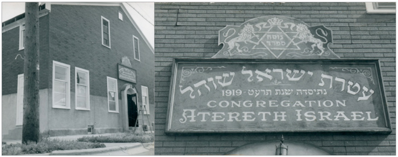
FIG. 11. EXTERIOR AND SIGN OF ATERETH ISRAEL SYNAGOGUE (1919), 469 MAGNUS AVENUE, WINNIPEG, MB.

amalgamating throughout the late nineteenth and early twentieth centuries, when Jewish immigration to Winnipeg was in full flow.