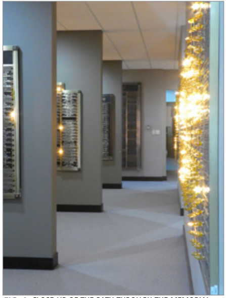
FIG. 4. CLOSE-UP OF THE PATH THROUGH THE MEMORIAL LOUNGES FROM THE SOUTH, ILLUSTRATING THE COMMEMORATIVE WALLS. | SHARON GRAHAM, FEBRUARY 2021.

this wing. The three rooms are divided like an upper-case letter E with an extra horizontal arm, with two walls, like two vertical dashes, standing next to them, thus making all the rooms open on one side. Figure 4 shows the edges of three of the four interior walls of the E-shaped construction which makes up the three rooms.