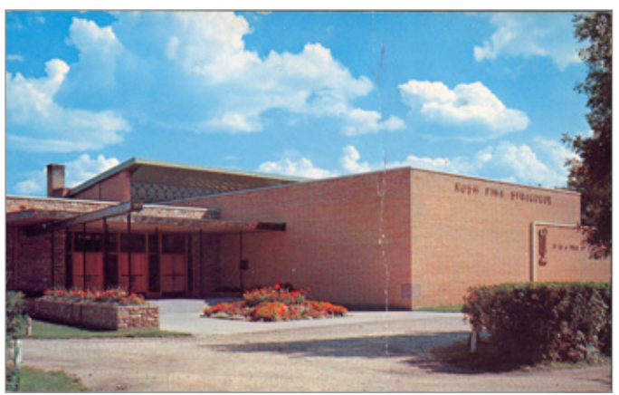
FIG. 9. EXTERIOR OF ROSH PINA SYNAGOGUE AS IT APPEARED ON A 1970S COMMEMORATIVE POSTCARD.