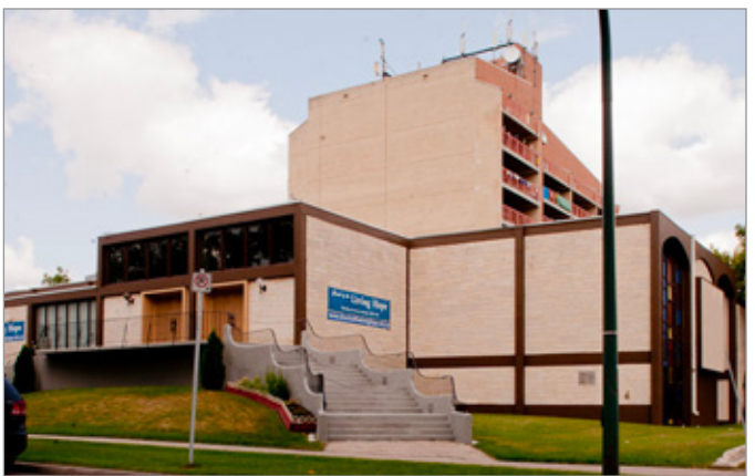
FIG. 10. EXTERIOR OF B'NAY ABRAHAM SYNAGOGUE.

revenue as well as creating a comfortable space for more extensive and expensive Jewish celebrations. The higher incomes of the second and third generations of Winnipeg Jewry, and their disinterest in daily religious practice, were reflected in this attractive edifice.