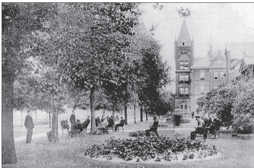
People in the gardens and landscaped grounds of Mimico Asylum, later renamed Lakeshore Psychiatric Hospital – a postcard view from about 1930, courtesy of CAMH Archives, Pleasance Kaufman Crawford fonds, F42.4.4.

The fonds consists of about 30 cm. of textual records, sixty-five photographs and ten architectural drawings predominantly dating from between 1986 and 2002. More specifically, Ms. Crawford's research files concern the history of the