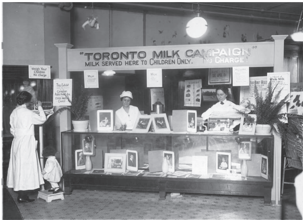
Nurses giving out free milk and weighing a child at a booth in the T. Eaton store as part of the Toronto milk campaign, 1921.

The timely arrangement and description of these