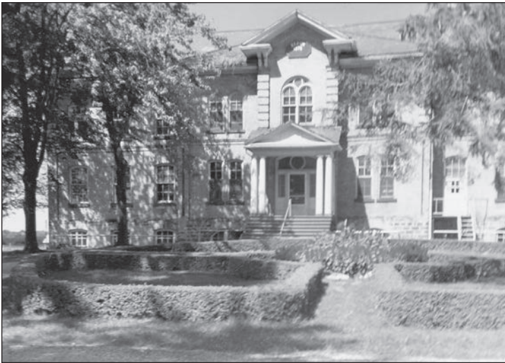
Elgin House of Industry, courtesy of Elgin County Archives

Residence in the County of Elgin was usually required for admission, but "transients requiring immediate attention" were occasionally committed as well. Admissions were subject to the approval of the Inspector and a committee of three