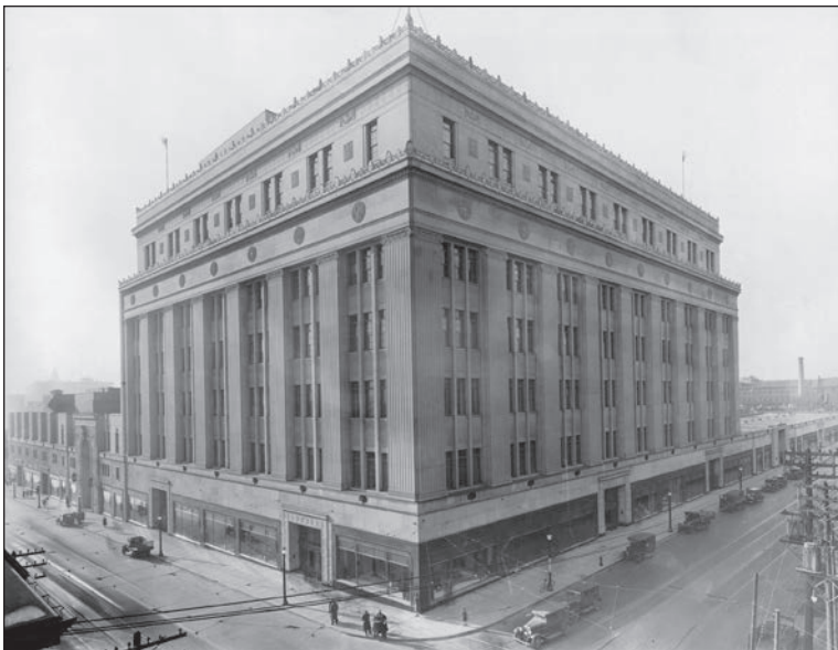
Eaton's store at College and Yonge, 1927-40.

The collection also contains 431 architectural drawings, survey plans and decorative drawings dating from 1900 to 1975. These records mainly con-