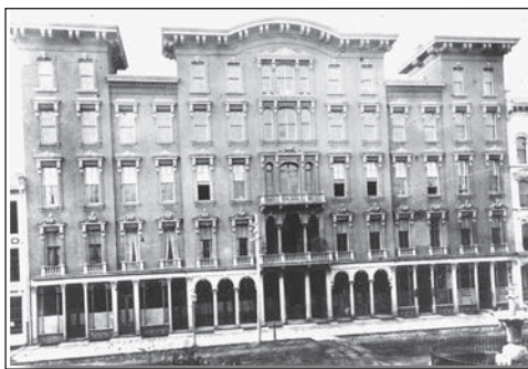
Wesleyan Ladies College building.

There is a complete set of catalogues from the college showing lists of students, graduates, staff and the complete list of curriculum for the different degrees and certificates that could be earned by the students. Researchers interested in the education of women in the nineteenth century will find a wealth of information documenting the types of studies that the college offered. Science, language and higher mathematics were included alongside the more traditional studies of art and music.