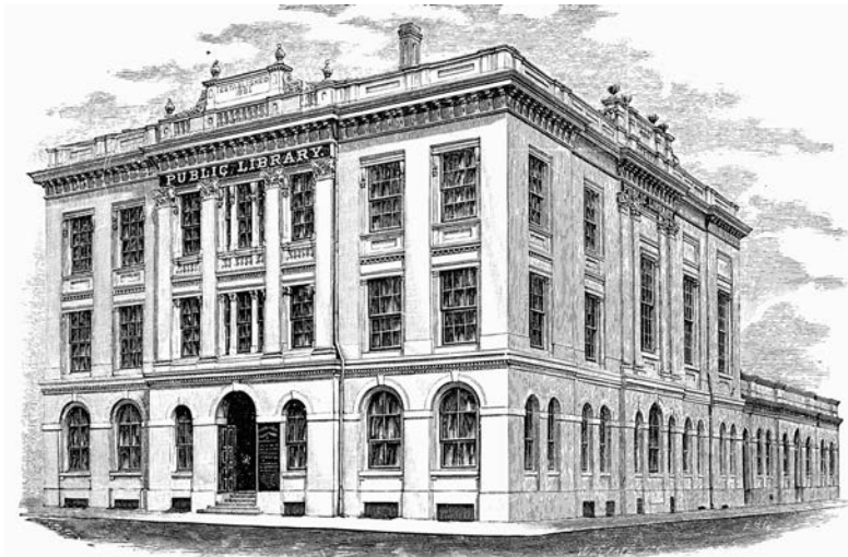
In 1883 the Toronto Public Library took over the Mechanics Institute building (1854). When the Carnegie library opened in 1908, the building became the Church Street branch. From The Ontario Library Association: an historical sketch 1900-1925 (Toronto: University of Toronto Press, 1926), 190.

and in 1856 he finally succeeded in his ambition of establishing in the Normal School building an Educational Museum for Upper Canada. Here visitors were invited to admire copies of the Great Masters and sets of engravings that had been selected by Ryerson himself, and to consult a library of art books. An art school was located on the premises nearby. The museum collections were maintained