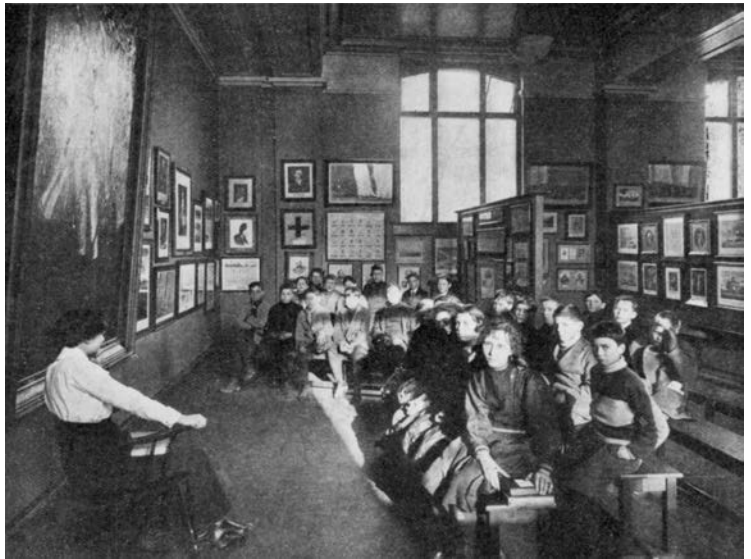
"The 'Story Hour' in the Public Library," Globe 12 April 1913. Photograph taken in the J. Ross Robertson Picture Gallery, lower level of the Toronto Public Library, College and St. George Streets.