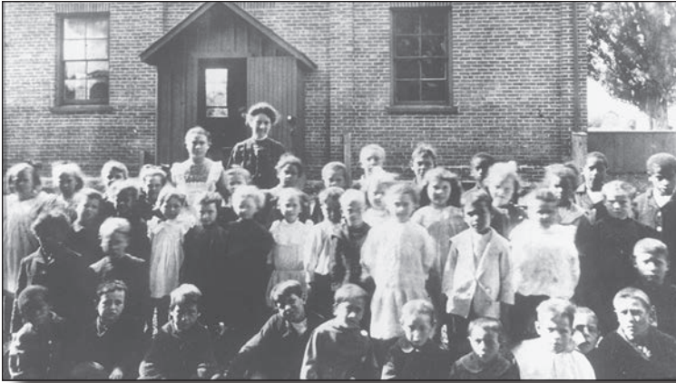
School class of both Black and White students.