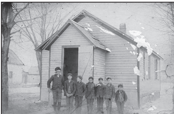
Children in front of the Marble Village Coloured School, c.1900. Black Ontarians banded together to create their own schools while, at the same time, challenging their exclusion from the public schools.

a given point. Archives staff may be able to offer advice once initial background research has been done. Details of many of the above-mentioned materials, including both private and government records, can be found by searching the Archives Descriptive Database located on the Archives