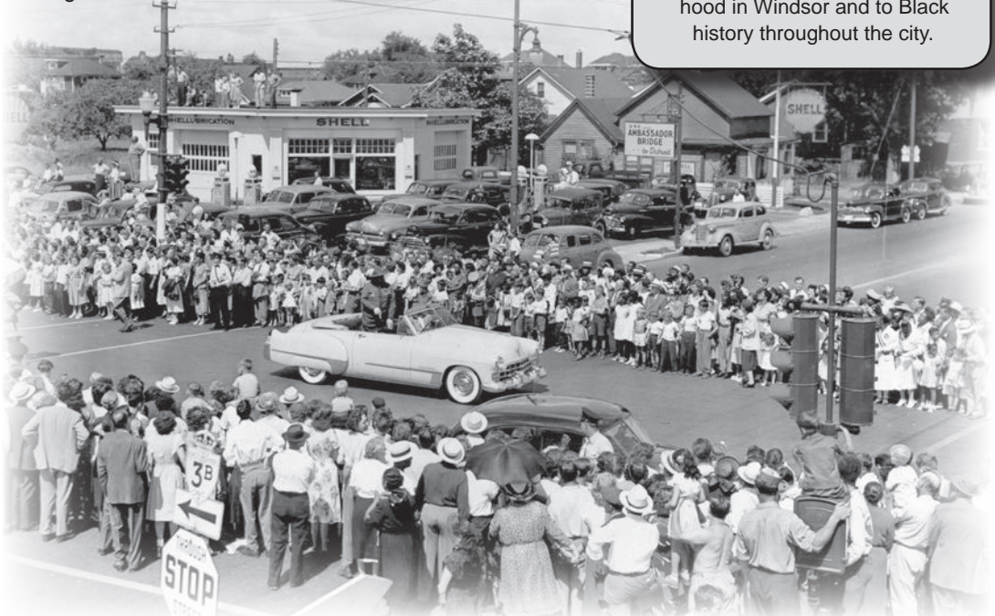
Emancipation Celebration Parade on Ouellette Avenue at Giles Boulevard, Windsor, c.1950.

Records relating to the residents, past and present, of the McDougall Street Corridor Neighbourhood in Windsor and to Black history throughout the city.