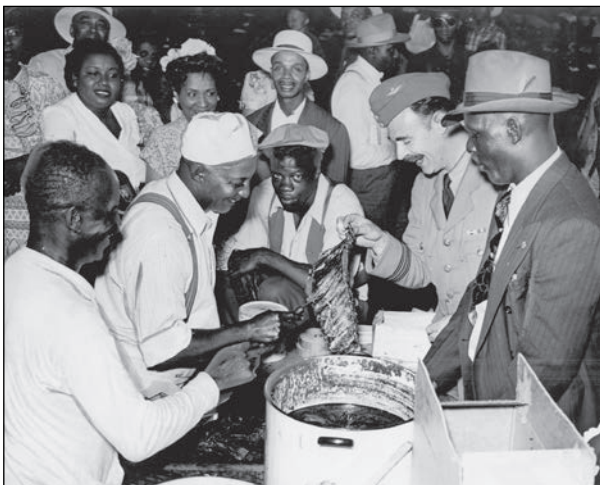
"Late Night Snack": Emancipation Celebration festivities at Jackson Park, Windsor, c.1944.

neither collection is processed at the time of writing, it is anticipated that they will be ready for researchers in the spring of 2007.