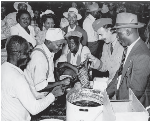
"Late Night Snack": Emancipation Celebration festivities at Jackson Park, Windsor, c.1944.